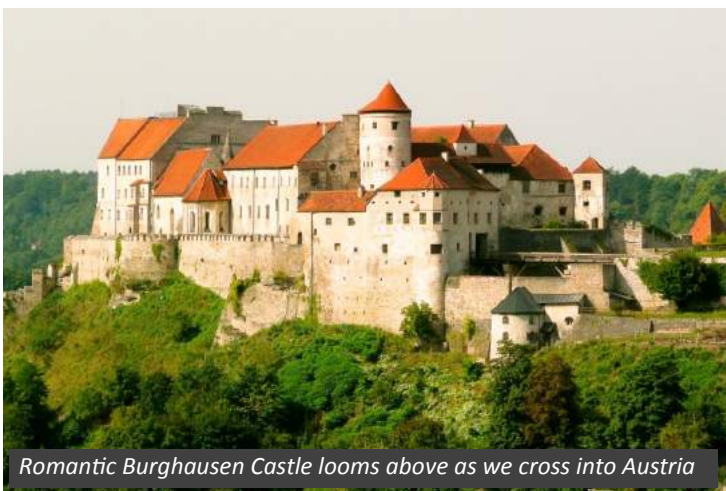
Romantic Burghausen Castle looms above as we cross into Austria

Today we experience a true highlight of the tour—the unique opportunity to put our beer knowledge into practice with a working session at a craft brewery high in the breathtaking scenery of Austria's Tyrol. Together we craft our own beer, from deciding the recipe and selecting the malt through starting fermentation. Throughout the unique experience, we sample the full range of excellent beers produced by this distinctive Alpine brewery as well as enjoy a traditional lunch with its founders. This afternoon we continue to historic Salzburg which offers one of the best-preserved city centers in the German-speaking world, earning it a listing as a UNESCO World Heritage Site. We enjoy a walking tour of the Old Town followed by a visit to the celebrated Stiegl Brauwelt museum where we have the opportunity to sample some jungbier (young beer). This evening we gather for a special closing reception and final dinner together. Afterward, we visit some of this city's beloved beer halls. (B, L, R, D)