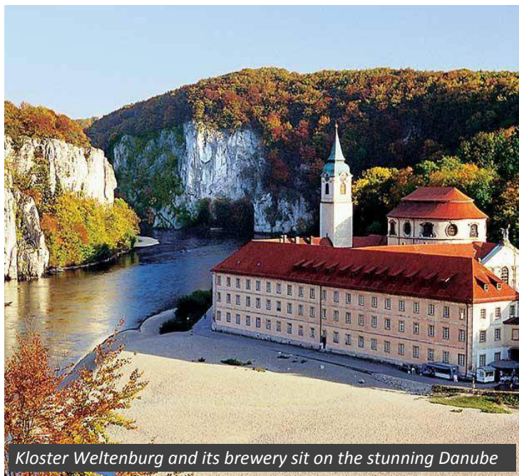
Kloster Weltenburg and its brewery sit on the stunning Danube

famed brew from steins and watch boats come and go upon the steady current of the mighty Danube. This afternoon we continue our journey north to the historic city of Nuremberg where we enjoy an engaging tour of its picturesque center before descending to explore the city's fascinating web of rock-cut beer cellars that lie beneath its streets. For over 700 years the denizens of Nuremberg have been storing their beloved low-temperature-loving, bottom-fermenting "red beer" in these subterranean cellars that are cut into the Burgsandstein (Nuremberg's red sandstone). In some cases these cellars reach an impressive four-layers deep, and they are so stable that during the air raids of World War II many citizens found shelter in these historic vaults which now span over six acres. This evening we travel north into the region of Upper Franconia—the epicenter of brewing in Bavaria—to the spectacular city of Bamberg which was awarded the status of UNESCO World Heritage Site in 1993 due to its impressively well-preserved architecture. The interesting mix of magnificent architectural styles and baroque town houses creates an atmosphere which captivates many visitors as soon as they arrive. Following some time to relax, we gather to enjoy a special dinner together at one of the city's historic restaurants and then visit some of its most lively and atmospheric beer halls. (B, D)