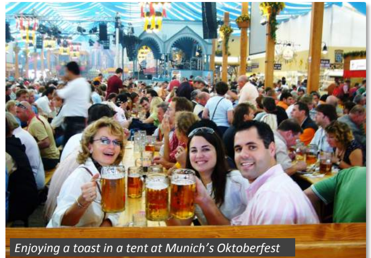
Enjoying a toast in a tent at Munich's Oktoberfest