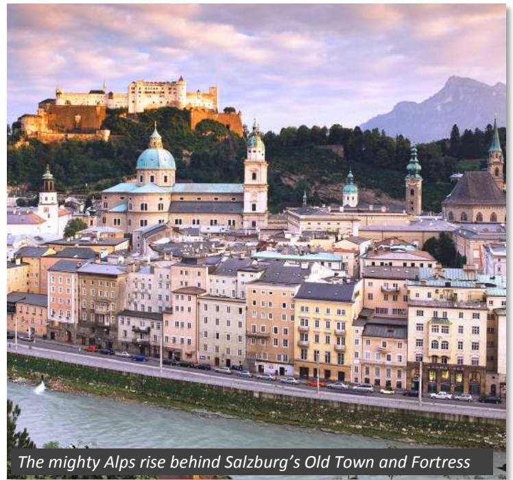
The mighty Alps rise behind Salzburg's Old Town and Fortress

After breakfast this morning you take a “final exam” in brewing and beer tasting, which tests your newly-acquired beer knowledge. Upon successfully passing, you are awarded a Certificate of Beer Knowledge signed by our tour leader himself. Afterward, we enjoy some more time to explore Salzburg’s charming and historic center. You may wish to tour the actual home where Mozart was born (the Mozarteum), explore the iconic Hohensalzburg Fortress which towers above the Old Town, or simply wander the narrow streets lined with cafes and shops. Midday we experience breathtaking Alpine scenery on the bus journey back to Munich where our tour concludes. Those who are able may choose to stay an extra night here in order to attend the festive closing ceremonies of Oktoberfest this evening. (B)