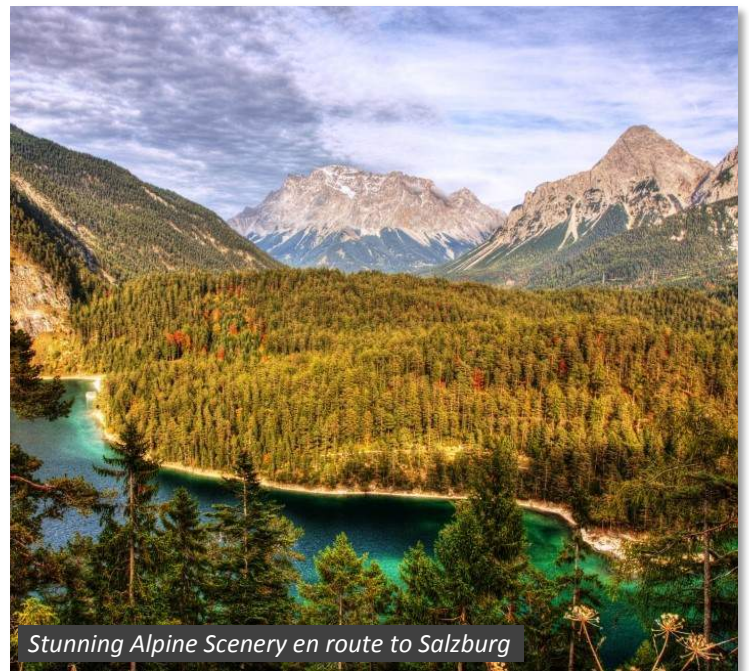
Stunning Alpine Scenery en route to Salzburg

We depart Bamberg this morning and enjoy a pleasant drive through the beautiful Upper Franconia region of Bavaria. We stop in the town of Bayreuth to visit the Maisel Brewery and Cooperage Museum which provides us with a glimpse of the significant role that casks and their coopers play in the maturation of beer. This afternoon we venture off the beaten path into the Upper Palatinate (Oberpfalz) region of Bavaria, home to the legendary Zoigl beer—only available here in the remote north where it's brewed. We sample this unique, dark-ish artisanal brew and enjoy lunch in one of the few remaining communal brew-houses where it is still crafted by families on a rotating basis. Tonight we rest our heads at one of the world's few