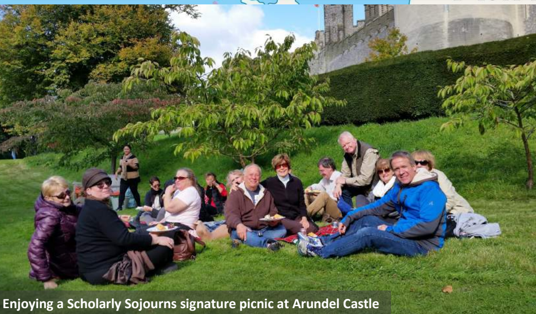
Enjoying a Scholarly Sojourns signature picnic at Arundel Castle

Rain is likely at this time of year. Participants are encouraged to bring a lightweight, waterproof jacket or a small umbrella. The humidity levels vary greatly depending upon location. Inland is hotter and drier, while the coastal climate is slightly cooler and more humid.