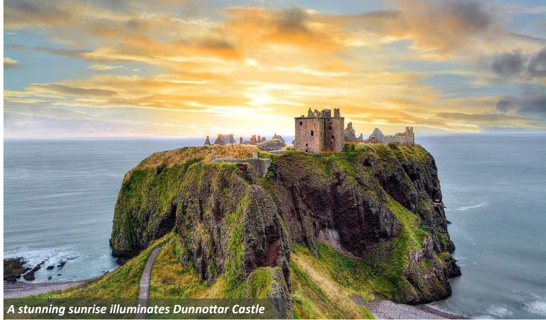
A stunning sunrise illuminates Dunnottar Castle