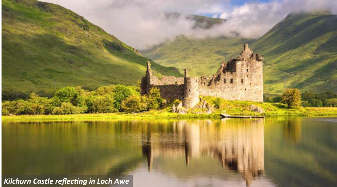
Kilchurn Castle reflecting in Loch Awe

Not only our name, but also what we call our flagship tours, Scholarly Sojourns are intellectually-stimulating travel programs that explore fascinating topics in history, literature, archaeology, art history, and science. Designed and guided by distinguished scholars, these engaging journeys provide the unique opportunity to explore a subject on location.