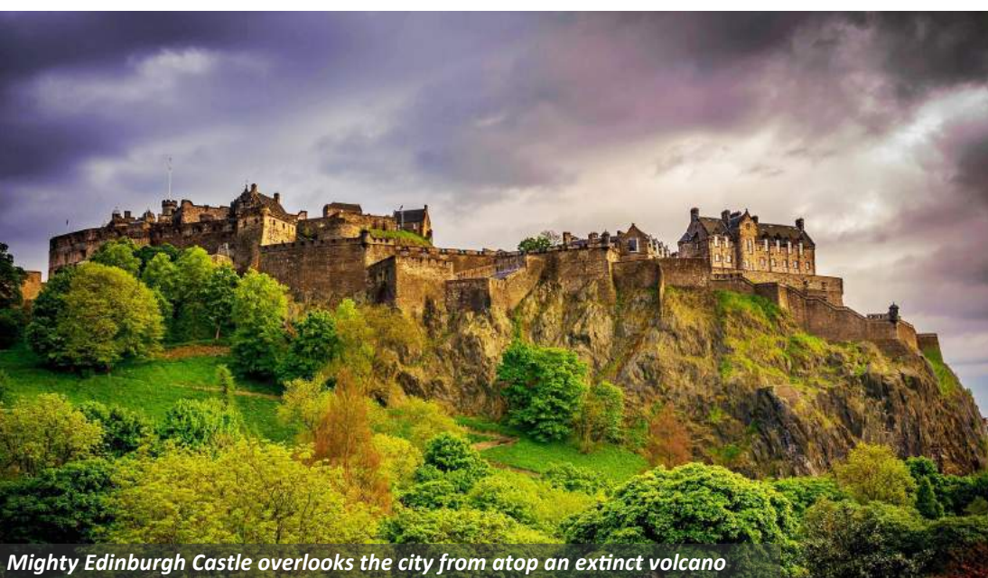
Mighty Edinburgh Castle overlooks the city from atop an extinct volcano