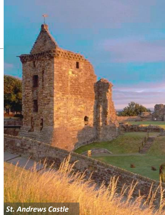
St. Andrews Castle

Departing Carberry Tower Hotel this morning, we explore Craigmillar Castle—a well-preserved edifice that dates from the 14th-Century and is famed as the place Mary Queen of Scots came to convalesce in November of 1566 following an illness after the birth of her son, the future James VI. Next, our journey takes us west along the great divide of Scotland to visit Bothwell Castle, which commands a prominent location above the River Clyde just outside Scotland's largest city, Glasgow. Following lunch, we continue to Dumbarton Castle which sits at the base of a 240-foot high plug of volcanic basalt known as Dumbarton Rock—a site which has a long, fascinating, and somewhat mysterious past. Its earliest residents were known to have traded with the Romans. This evening we take a scenic drive along the famous “Bonnie, Bonnie Banks o' Loch Lomond” and then up and over the ‘Rest and Be Thankful’—one of Scotland's highest mountain passes—to reach picturesque Inveraray, set upon the banks of Loch Fyne. After checking into our atmospheric lodging, the remainder of the evening is left free to explore and dine in the charming town center. [B]