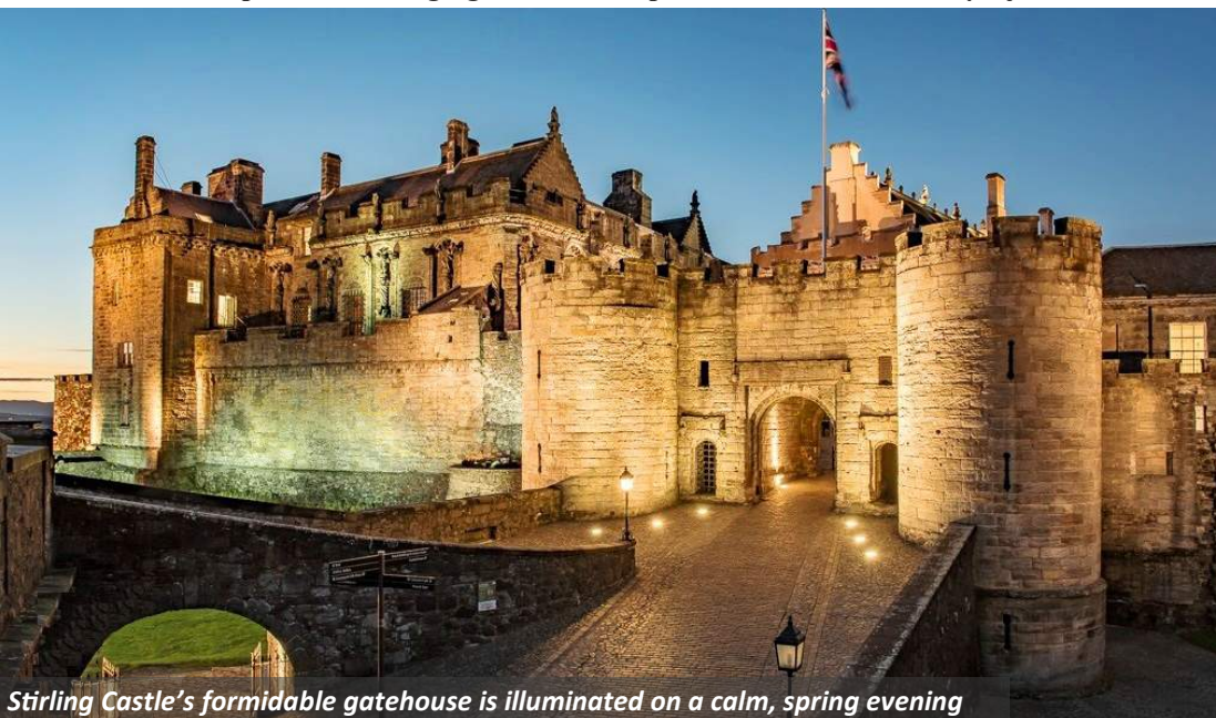
Stirling Castle's formidable gatehouse is illuminated on a calm, spring evening