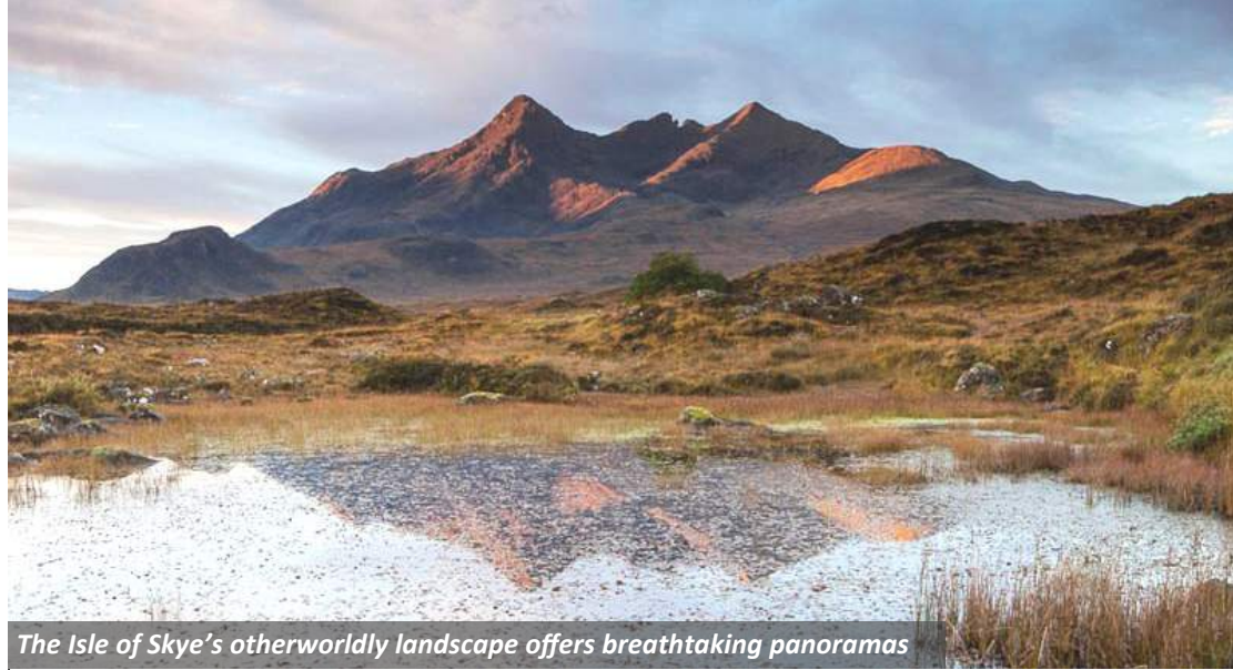
The Isle of Skye's otherworldly landscape offers breathtaking panoramas