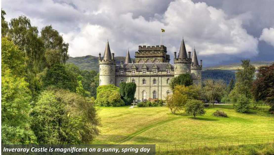
Inveraray Castle is magnificent on a sunny, spring day