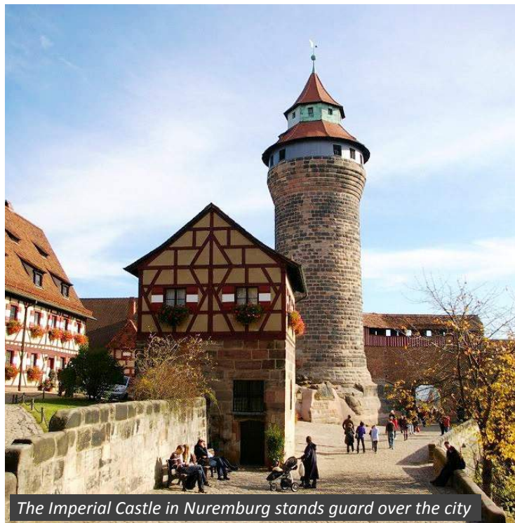
The Imperial Castle in Nuremberg stands guard over the city