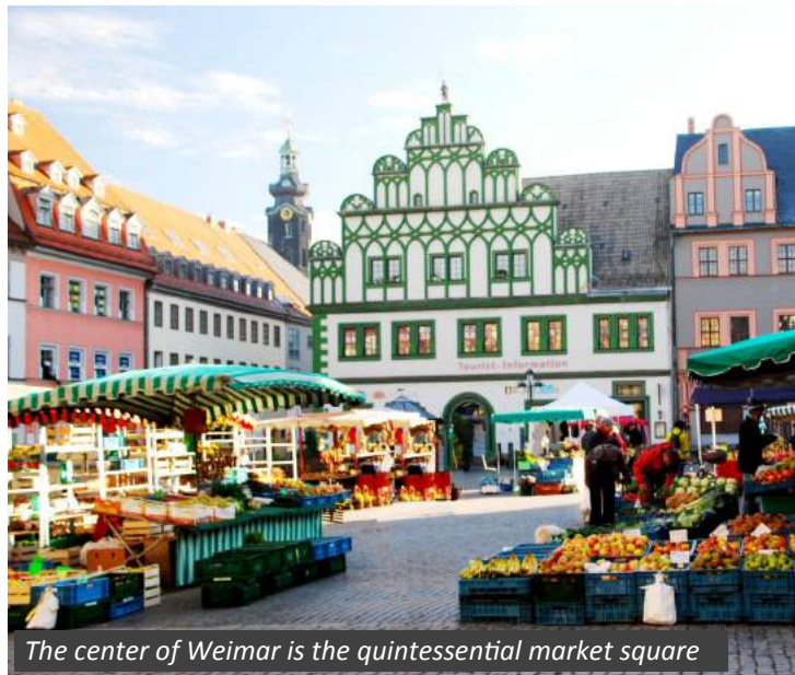
The center of Weimar is the quintessential market square

Following breakfast, we take a guided walking tour of historic Weimar. The city, once the capital of Germany under the Weimar Republic, was the home of many celebrated German writers, artists, and musicians, most notably Goethe, Schiller, and Liszt. After our tour, we visit one of the city's fantastic bakeries—a setting at the very heart of Those Who Save Us —where we sample some of the delicious breads and pastries while enjoying passages from the novel. At