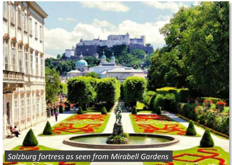
Salzburg fortress as seen from Mirabell Gardens