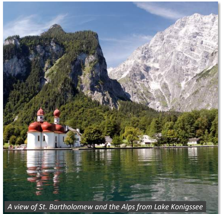
A view of St. Bartholomew and the Alps from Lake Königssee