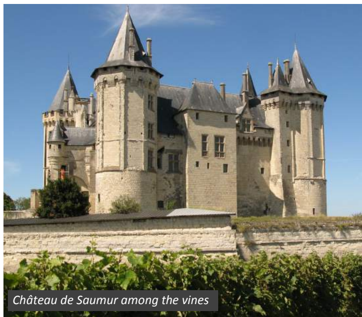
Château de Saumur among the vines