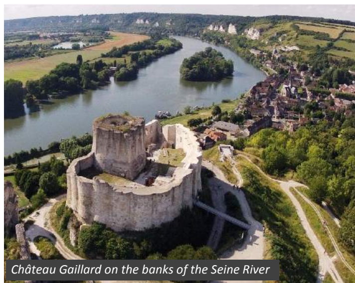
Château Gaillard on the banks of the Seine River

We depart Rouen this morning to make our way north to the port city of Calais. From Calais, we make a channel crossing just as the Plantagenets so often did, towards the white cliffs of Dover. Our first visit on English soil will be to the impressive Dover Castle, which is also called the “Key to England” owing to its strategic