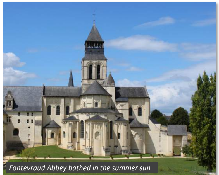
Fontevraud Abbey bathed in the summer sun

This morning, we continue our walking tour of Fontevraud Abbey before departing south for Poitiers, the home city of Eleanor of Aquitaine. In Poitiers, we make a late morning visit to the impressive Romanesque Church of Notre-Dame-la-Grande, a true architectural gem dating back to the 11th century. Following lunch, we set out to explore several other sites