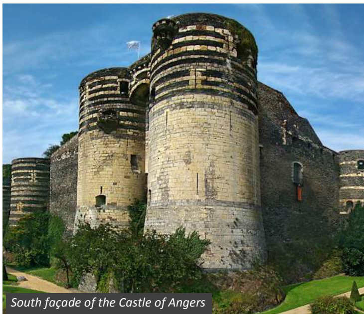
South façade of the Castle of Angers

We travel north this morning along the scenic Loire Valley to Angers, the capital of the Plantagenets' ancestral county of Anjou. Here we get to fully explore the great Castle of Angers, one the most popular homes owned by the early Plantagenets. The castle is home to an incredible medieval treasure in the 14 th century Tapestry of the Apocalypse, which is also the oldest surviving French tapestry. After taking lunch at your leisure, we visit the archaeological site of the Collegiate Church of Saint Martin. This impressive church, now fully restored to its original splendor, has remains of the first Christian church on this site dating from the Roman period. We leave Angers on a pleasant afternoon journey along the Loire River to reach the town of Saumur, another key town held by the Counts of Anjou. Here we take a tour of one of the favored residences of the Plantagenets—the enchanting Château de Saumur. Rebuilt in the 14 th and 15 th centuries, the chateau is famously depicted in the Tres Riches Heures of the Duc de Berry. Following our visit to the chateau, we enjoy an early evening wine tasting at the caves of Ladubay House. These exquisite sparkling wines are produced using the exact same method as Champagne, so what better way to celebrate a splendid summer day. After we return to the hotel in Fontevraud, we gather for a lively dinner discussion with Dr. Marshall. (B, D)