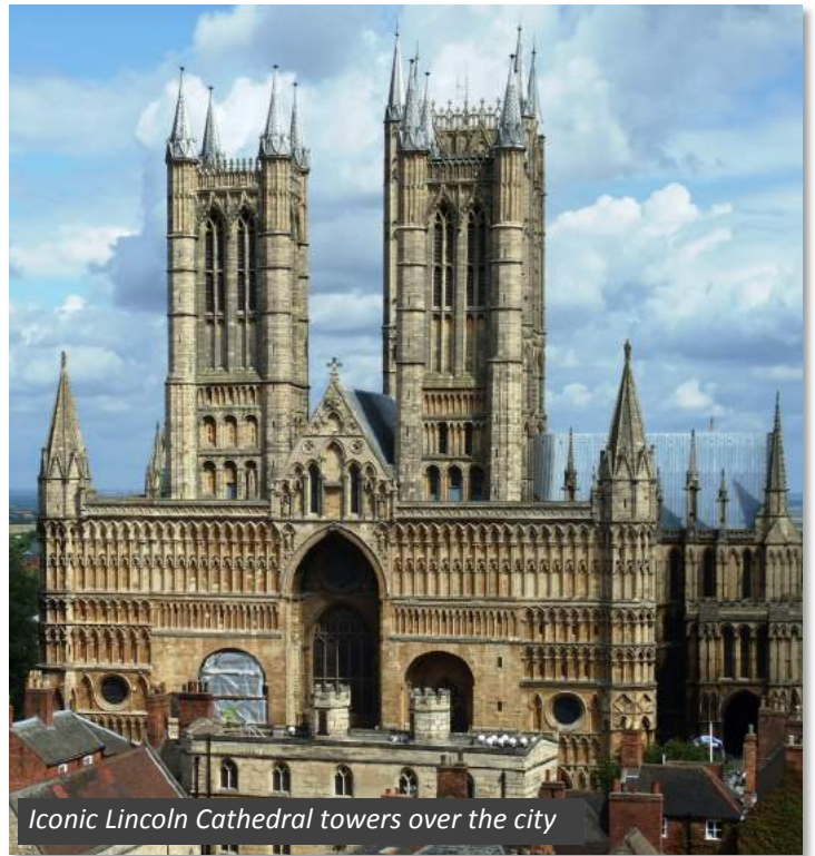
Iconic Lincoln Cathedral towers over the city

Following breakfast, we take a walking tour of historic Lincoln where the origins of the Roman town plan, dating to the first century AD, can still be traced. In fact, while Lincoln was founded by the Romans around the year 80, it was expanded in the post-Roman period and became one of England's foremost cities during the Middle Ages. Next we visit imposing Lincoln Castle, which was constructed in 1068 on the grounds of a former Roman fortress by William the Conqueror to help bolster his defensive capabilities in this region. Our visit includes a viewing of the Magna Carta Exhibition where one of only four of the original documents from 1215 is housed. History comes alive as we read the words of this landmark document that signified a turning point in the relations between kings and men and still reverberates with us today. After lunch, we make our way to the stunning spires of Lincoln Cathedral, which dominates the city's skyline. Considered one of the most impressive cathedrals in all of Europe, it had a whole sequence of improvements carried out under the patronage of Plantagenet kings. It is fitting that our tour draws to a close in this setting as we reflect upon our journey