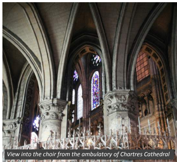
View into the choir from the ambulatory of Chartres Cathedral

This morning we visit stunning Chartres Cathedral—a marvel of medieval Gothic architecture that is a UNESCO World Heritage Site. The innovatively-designed, 12 th -century structure is renowned for its numerous sculptures as well as its much-celebrated collection of stained glass. Next, we travel north to Normandy where we explore a particularly significant Plantagenet site. The Château Gaillard at Les Andelys, which dominates the Seine River below, was a favored project of King Richard I. We enjoy a guided tour of this formidable castle that was strategically important in defending Plantagenet land. Afterward, we continue to Rouen, the capital city of Upper Normandy. Here, we are treated to a walking tour of the historic center which includes Rouen Cathedral—where several Plantagenets, including the heart of Richard the Lionhearted, are interred—and the marketplace where Joan of Arc was burnt at the stake in 1431. After our stroll around Rouen, we gather with Dr. Marshall for a nice dinner and lively discussion. (B, D)