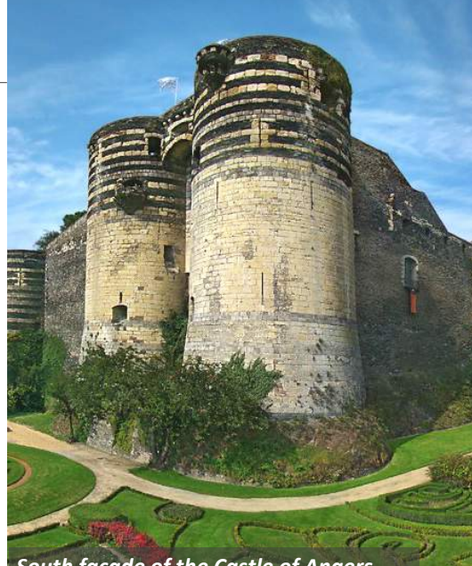
South façade of the Castle of Angers