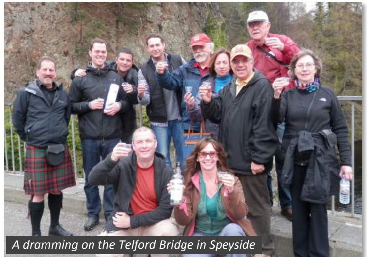
A dramming on the Telford Bridge in Speyside

Our day in Speyside begins with a morning stop to visit the celebrated Macallan distillery to view the iconic Easter Elchies House. Afterward, we continue to nearby Balvenie distillery for an extensive tour and structured nosing and tasting of six whisky expressions in its atmospheric reception room. The experience here also includes a private visit to the warehouse where you are able to sample whiskies from casks as well as fill your own souvenir bottle of