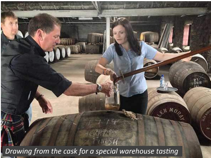
Drawing from the cask for a special warehouse tasting