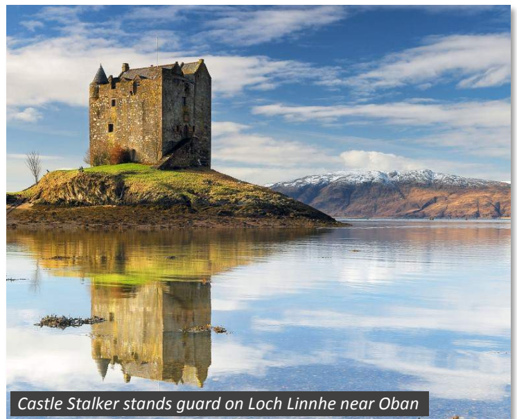
Castle Stalker stands guard on Loch Linnhe near Oban

We say a fond farewell to Islay this morning as we journey across the sea by ferry once again. Back on the mainland, we make a generous lunch stop in the picturesque town of Inveraray, providing plenty of opportunity for shopping, sightseeing, or perhaps a visit to its famous castle which has recently been featured on the television drama, Downton Abbey . Those wishing to buy some extra bottles for home may want to visit Loch Fyne Whiskies to explore the unmatched selection of this unique shop. This afternoon we visit Auchentoshan distillery for another fine example of Lowland malt and to explore the distillery's unique triple distillation process. This evening we arrive at our lodging upon the " Bonnie Banks o' Loch Lomond " and enjoy a bit of free time for a stroll before gathering for a special reception and our final dinner together. Be prepared for the pop quiz Ronnie likes to spring on this occasion! (B,R,D)