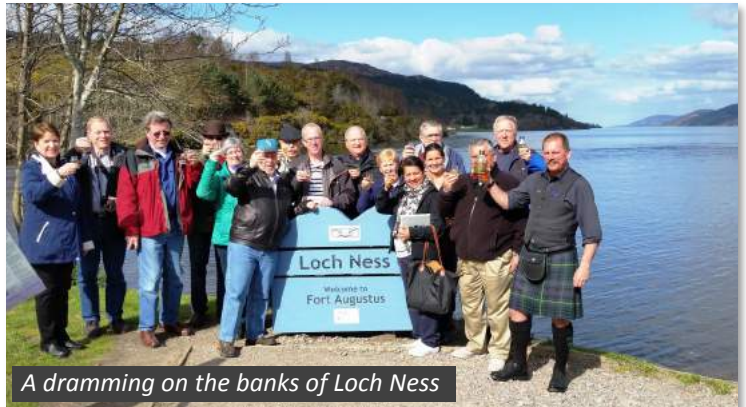
A dramming on the banks of Loch Ness

a-lifetime experience. This afternoon, we stop in the beautiful and historic city of Stirling where we enjoy time to explore its well-preserved and picturesque castle. The imposing citadel dates from 1110 AD and several Scottish Monarchs have been crowned in its halls, including Mary, Queen of Scots. This afternoon, we visit nearby Deanston distillery, the only distillery in Scotland to be electrically self-sufficient with power generated by an on-site hydro-energy facility. Following a tour which highlights some of the site's unique, Victorian features, we enjoy a final tasting before returning to Edinburgh where we say our goodbyes as the tour draws to a close. (B)