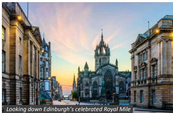
Looking down Edinburgh's celebrated Royal Mile