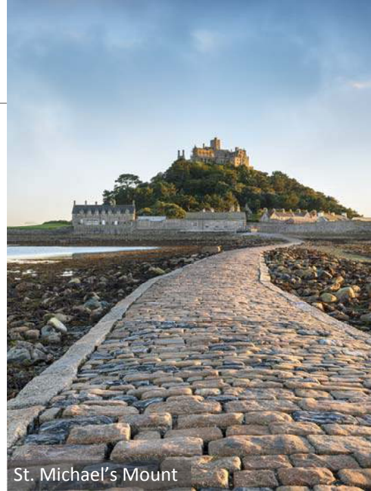
St. Michael's Mount

We travel east to Somerset this morning to visit the enormous, ancient hill fort known as Cadbury Castle. For centuries this prominent outcrop has been linked to King Arthur and widely regarded as one of the main contenders for the location of Camelot. Archaeological excavations have uncovered clear evidence of occupation during the Iron Age, and some locals believe that King Arthur still lies sleeping in a cave within the hill. We enjoy a Scholarly Sojourns signature picnic at the foot of this remarkable site before continuing to majestic Bath, a city so historically significant that it has been designated a UNESCO World Heritage Site. Here we consider how many historians, including Geoffrey of Monmouth, claim Bath to be the site of Arthur's last great battle, known as the Battle of Badon Hill, and then enjoy a generous period of free time to explore the city on our own. This afternoon we take a scenic drive through the breathtaking Cheddar Gorge—an amazing natural phenomenon that is Britain's largest gorge—which rewards us with stunning views. A short drive from here we find our resting place for the next two nights in Wells, England's smallest city and home to a celebrated 8th-century cathedral that is widely regarded as one of the most unusual and beautiful cathedrals in Britain. After checking into our historic hotel, the evening is free to explore the city's atmospheric, medieval streets and perhaps enjoy one (or more) of its traditional pubs. [B | L]