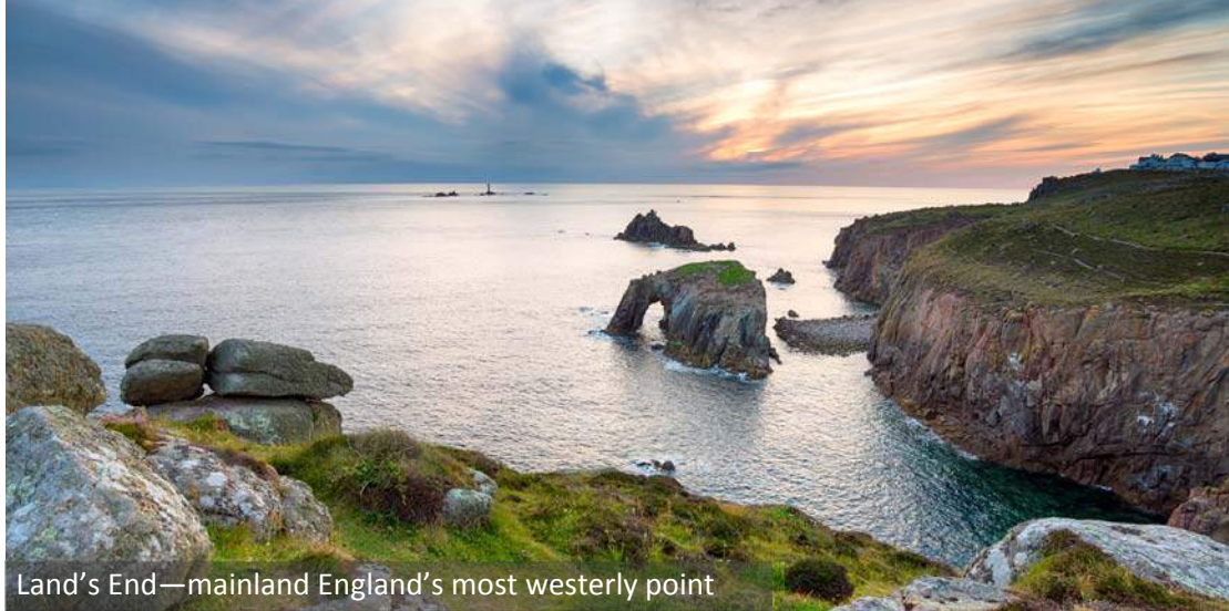
Land's End—mainland England's most westerly point