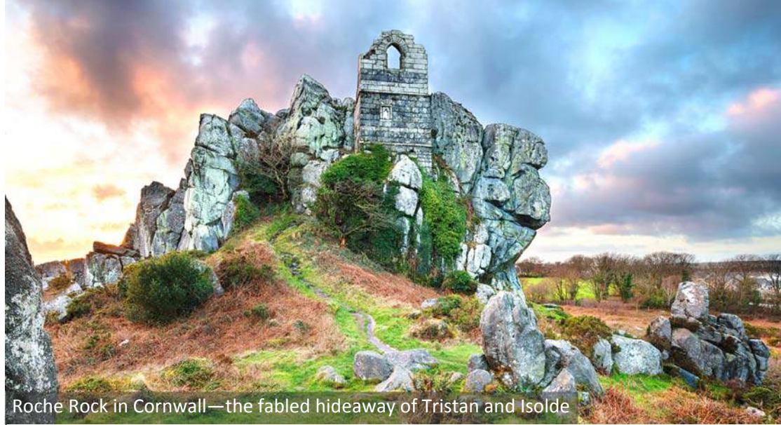
Roche Rock in Cornwall—the fabled hideaway of Tristan and Isolde

Not only our name, but also what we call our flagship tours, Scholarly Sojourns are intellectually-stimulating travel programs that explore fascinating topics in history, literature, archaeology, art history, and science. Designed and guided by distinguished scholars, these engaging journeys provide the unique opportunity to explore a subject on location.