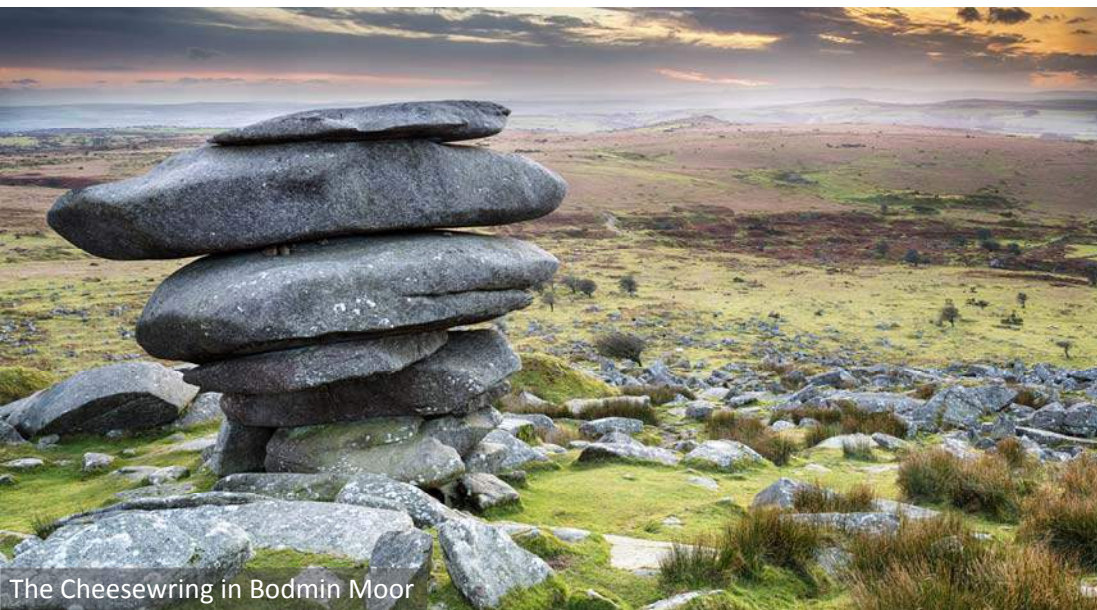
The Cheesewring in Bodmin Moor