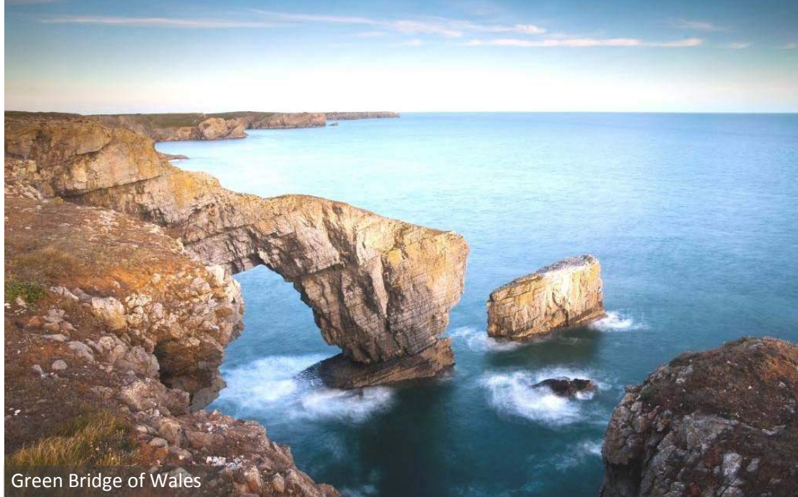
Green Bridge of Wales

Rain is likely at this time of year. Participants are encouraged to bring a lightweight, waterproof jacket or a small umbrella. The humidity levels vary greatly depending upon location. Inland is hotter and drier, while the coastal climate is slightly cooler and more humid.