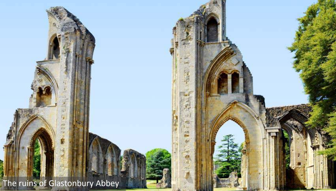
The ruins of Glastonbury Abbey