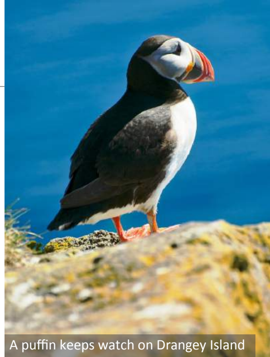
A puffin keeps watch on Drangey Island

We begin the day with a mesmerizing drive through some of the most fascinating terrain in Iceland, dotted with steaming geothermic pools, geysers, and bubbling mud pits. This afternoon we explore the sites of the Droplaugarsona Saga in the beautiful landscape around the East Iceland city of Egilsstaðir before traveling to the coastal town of at Djúpvogur to enjoy lunch and to visit the Museum House, which contains the fascinating East-Iceland Museum of Natu-