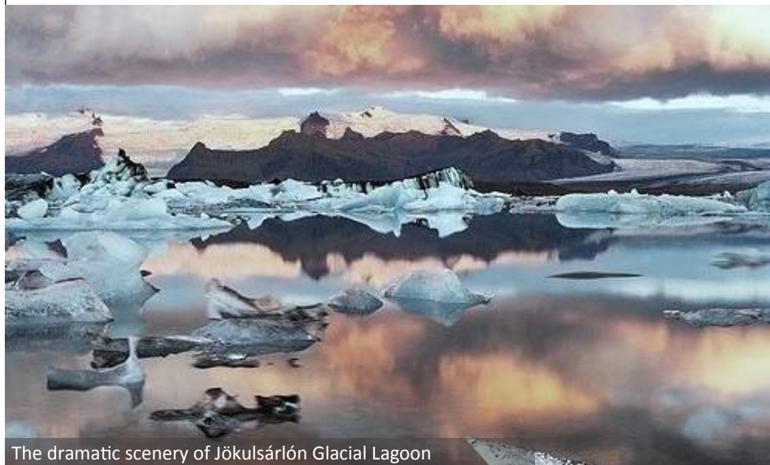
The dramatic scenery of Jökulsárlón Glacial Lagoon

Following breakfast, we enjoy a change of pace as we traverse the unique landscape on horseback to visit some of the locations from Njál's Saga. Afterward, we stop to admire nearby Seljalandsfoss—one of Iceland's most iconic and visually-stunning waterfalls—and then continue to the fishing community of Eyrbakkí to enjoy one last lunch together before departing for Keflavik International Airport where we say our goodbyes as the sojourn draws to a close. [B]