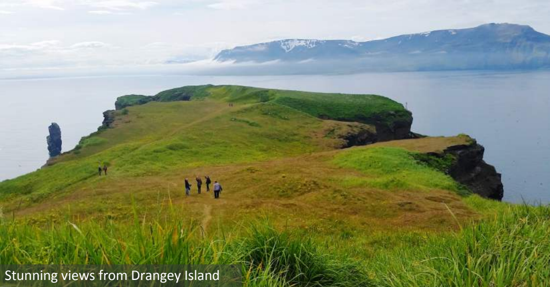
Stunning views from Drangey Island