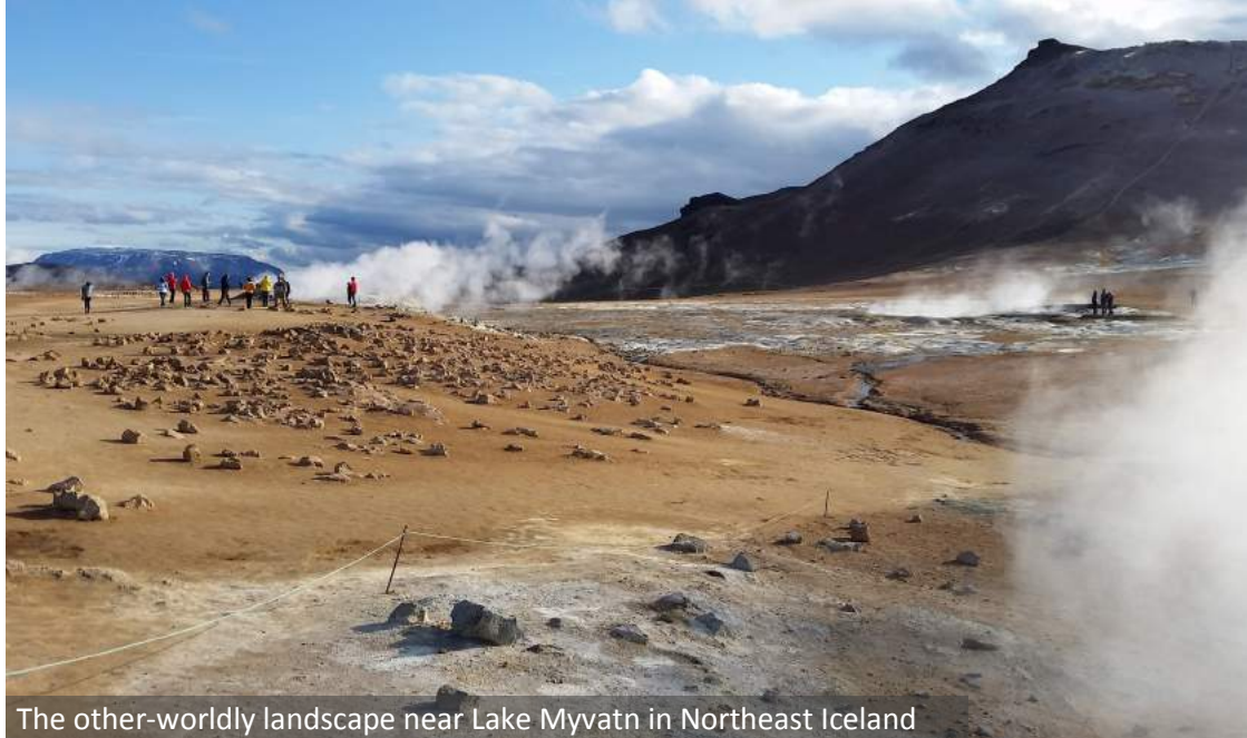
The other-worldly landscape near Lake Myvatn in Northeast Iceland