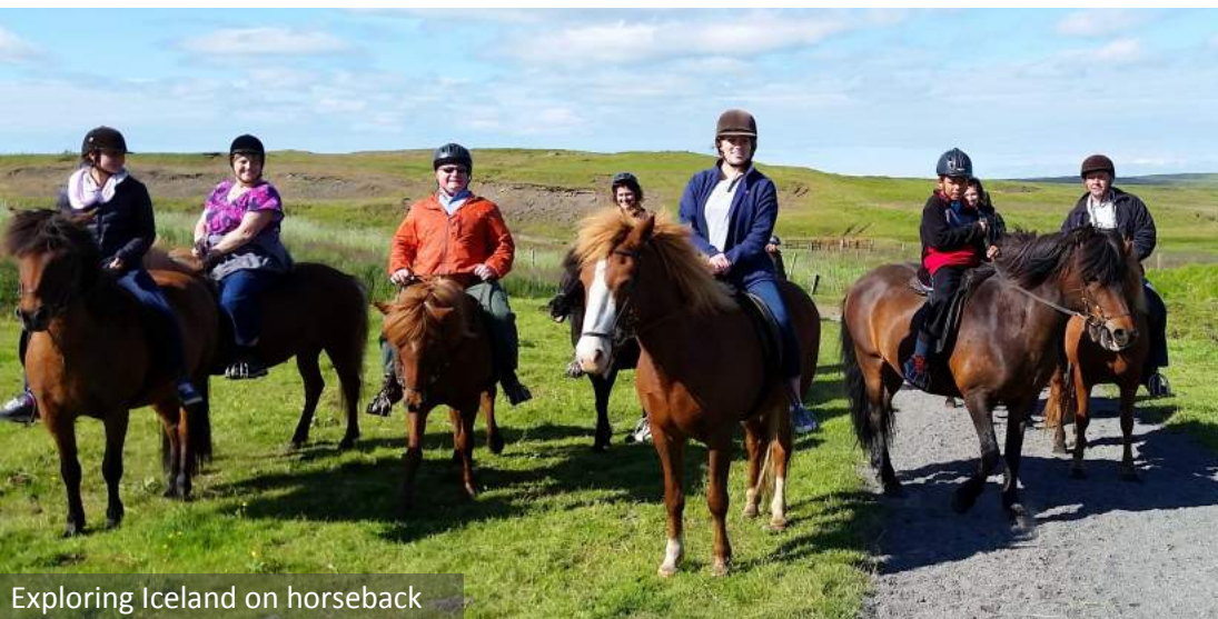
Exploring Iceland on horseback