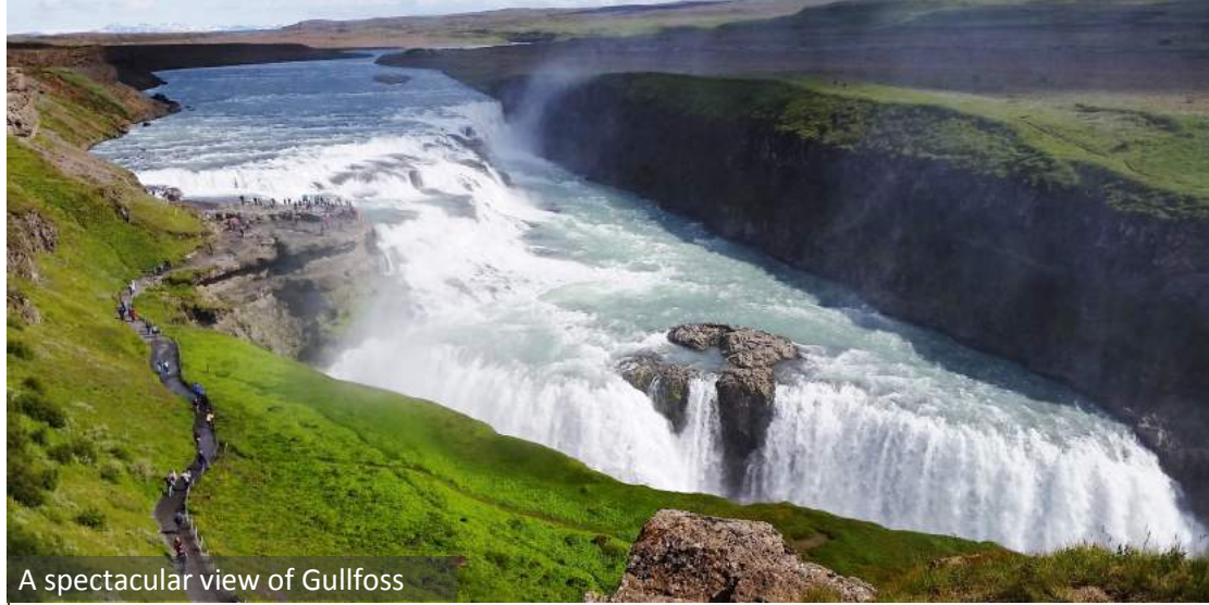
A spectacular view of Gullfoss