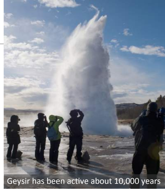
Geysir has been active about 10,000 years

Following breakfast and our morning briefing, we walk to the National Museum of Iceland. Its permanent exhibition, 'Making of a Nation - Heritage and History in Iceland', provides a fascinating glimpse into the history and founding of the Icelandic nation and showcases nearly 2,000 objects dating from the Settlement Era to the present day. Afterward, a short walk brings us to the Reykjavik 871 +/- 2 Settlement Exhibition, which offers a display of life during the Viking era and the opportunity to view the remnants of a 10th-century longhouse—thought to be Iceland's first man-made structure—which was just excavated in 2001. This afternoon, we head to Reykjavik's Old Harbor to embark on an whale-watching voyage. If we are lucky, our cruise allows us to witness a variety of sea life, including minke and humpback whales, white-beaked dolphins, and various seabirds in their natural habitat. Upon our return to Reykjavik, the rest of the evening is free to spend as you see fit. [B]