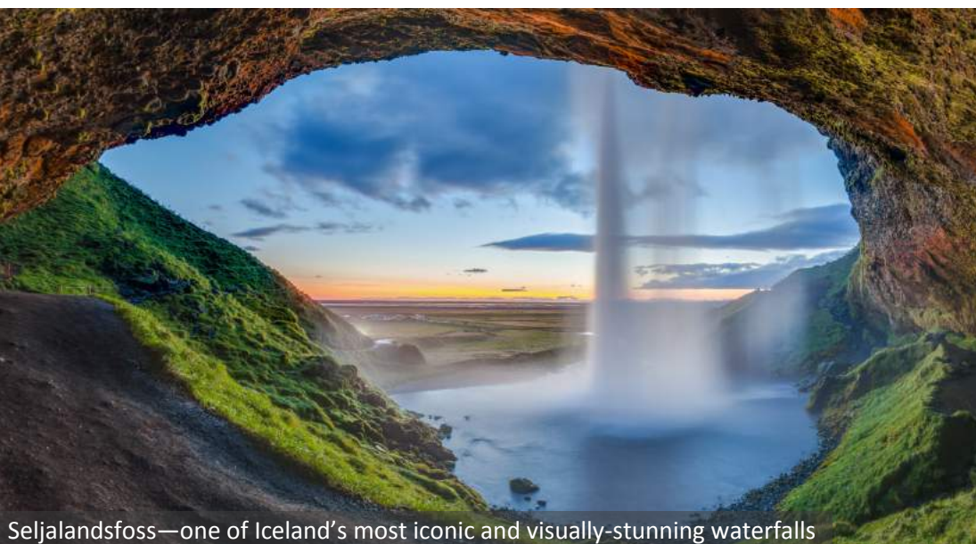
Seljalandsfoss—one of Iceland's most iconic and visually-stunning waterfalls