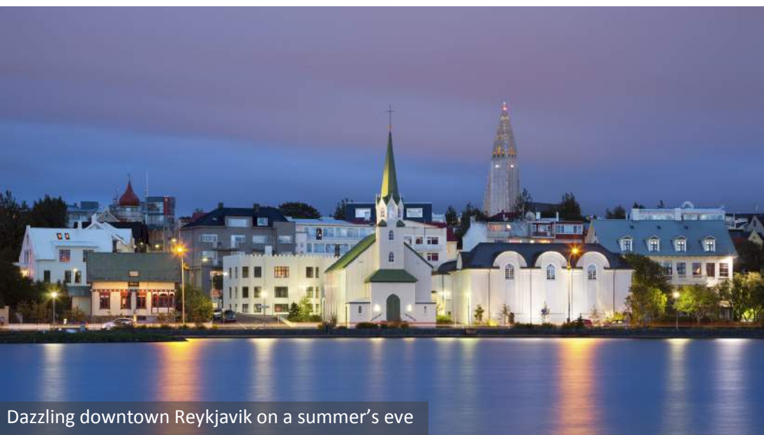
Dazzling downtown Reykjavik on a summer's eve