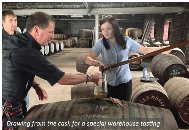
Drawing from the cask for a special warehouse tasting