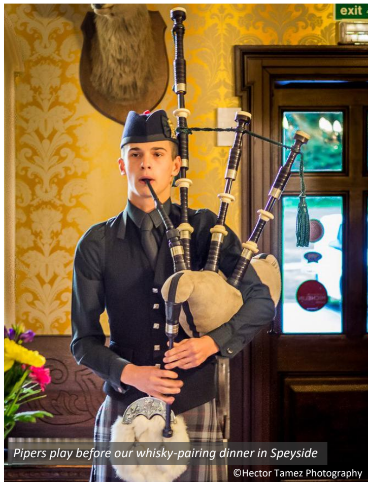
Pipers play before our whisky-pairing dinner in Speyside