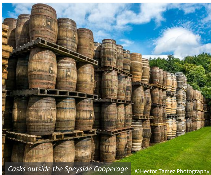
Casks outside the Speyside Cooperage

*Airport transfer only applies to those purchasing the optional group flight.