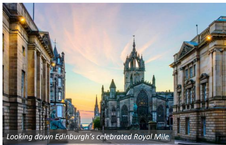
Looking down Edinburgh's celebrated Royal Mile