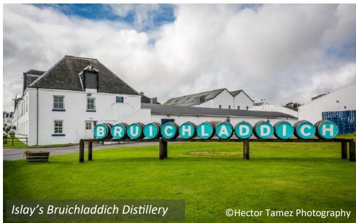
Islay's Bruichladdich Distillery