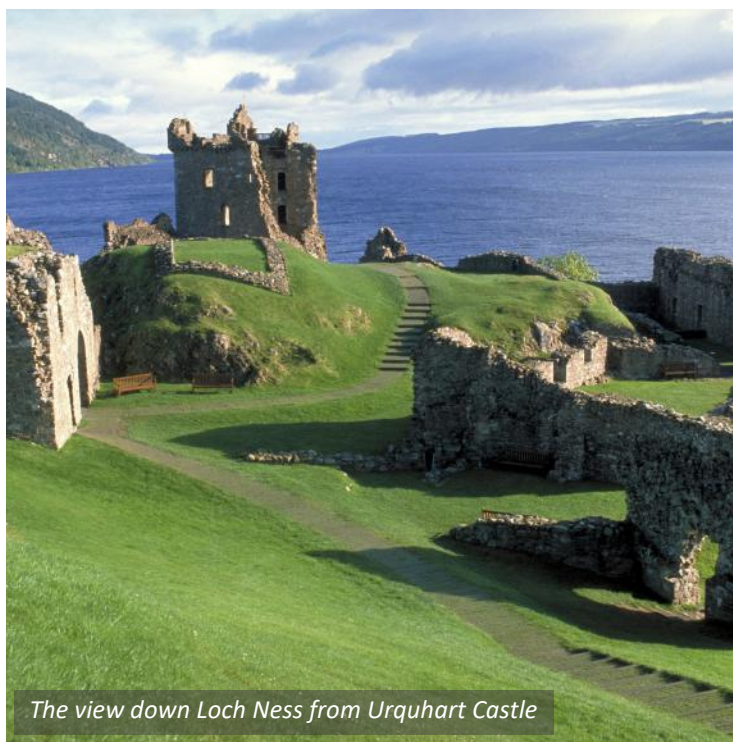
The view down Loch Ness from Urquhart Castle

Following breakfast, we make a final trip through The Highlands crossing the Rest-and-Be-Thankful mountain pass—one of the highest in Britain. At mid-morning, we enjoy a visit to Auchentoshan Distillery where we taste another fine example of Lowland malt and explore the distillery's unique triple distillation process. This afternoon we arrive at lovely Glengoyne Distillery, nestled in its idyllic setting on the edge of the highlands. Here you complete a comprehensive program in whisky blending which culminates with the opportunity for you to develop your own unique single malt. Your personal recipe is carefully recorded in Glengoyne's master book for posterity and you depart with a bottle of your single malt in hand. This evening we arrive in the historic city of Stirling where we enjoy a visit to its well-preserved and picturesque castle. The imposing citadel dates from AD 1110 and several Scottish monarchs have been crowned in its halls, including Mary, Queen of Scots in AD 1542. Afterward, we check into our hotel and enjoy a bit of free time to further explore the city before gathering for a special reception and our final dinner together. [B|R|D]