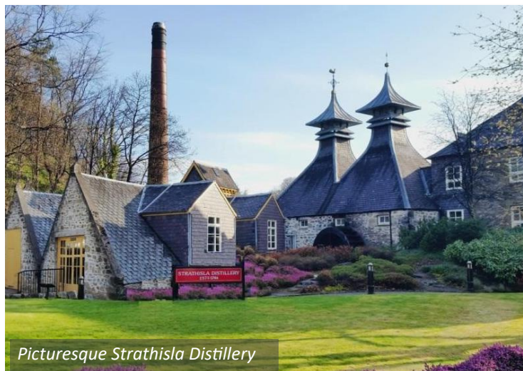
Picturesque Strathisla Distillery

*Saturday, September 30 only applies to those taking the optional group flight.