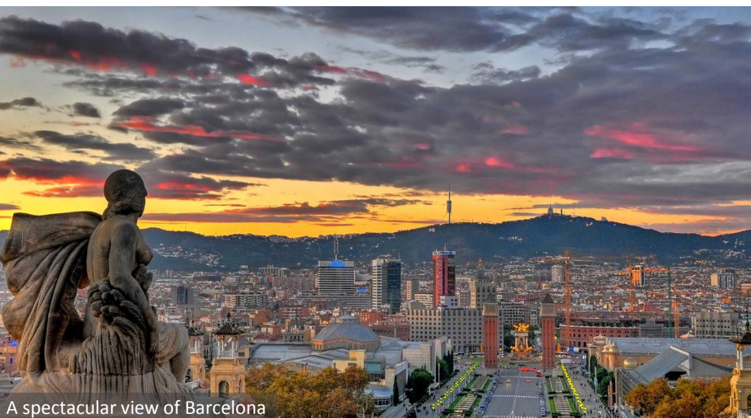
A spectacular view of Barcelona