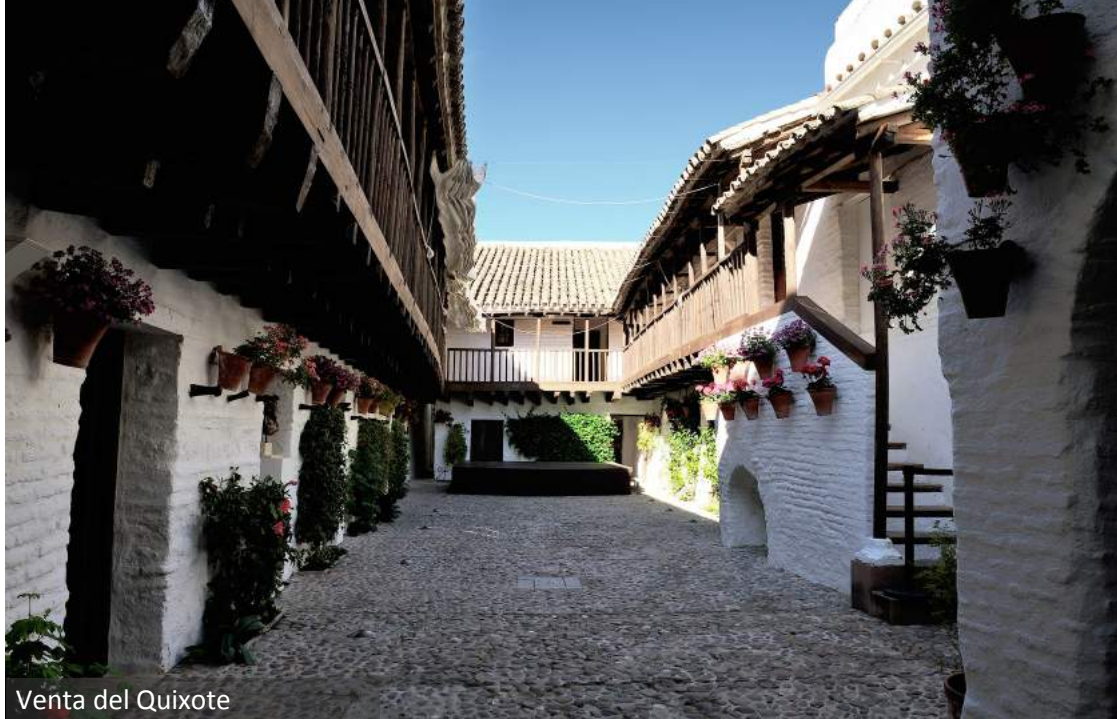
Venta del Quixote

Rain is fairly infrequent at this time but participants are still encouraged to bring a lightweight, waterproof jacket or a small umbrella. The humidity levels vary greatly depending upon location. Inland is hotter and drier, while the coastal climate is slightly cooler and more humid.