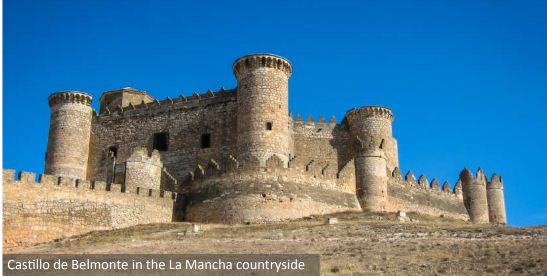
Castillo de Belmonte in the La Mancha countryside