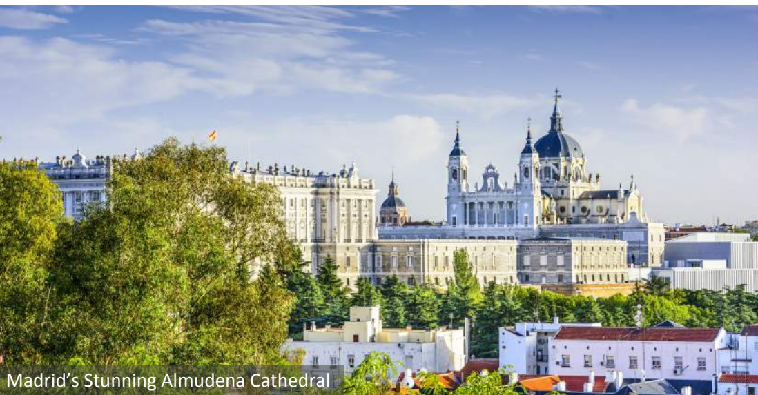
Madrid's Stunning Almudena Cathedral