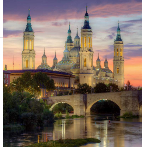
The majestic Basilica of Our Lady of Pilar

Following our daily briefing, we depart Madrid by bus to visit the picturesque town of Alcalá de Henares, birthplace of Cervantes and a UNESCO World Heritage Site. The streets, squares and churches in the historic town are all redolent of the Spanish Golden Age and impart a vision of what life would have been like in Castilian Spain four centuries ago. Our visit takes us to both the church where Cervantes was baptized and the house where he was born. The décor and furnishings of Cervantes' house, which is also a museum, provide a fascinating, authentic depiction of a mid-sixteenth-century Spanish household. The museum also houses an impressive array of early editions of Don Quixote, which presents an opportunity for Professor Stavans to share with us how the rich prose of Cervantes' writing fundamentally changed the Spanish language. After lunch, we return to Madrid for tours of the renowned Prado Museum and the famous Royal Armory. The latter's exquisite collection of medieval armor allows Professor Stavans to expand on some important themes from the novel, including knight errantry and the laws of chivalry. Afterward, the evening is free for you to explore the city's multitude of culinary and cultural delights. Your tour director is happy to offer dining suggestions. [B]