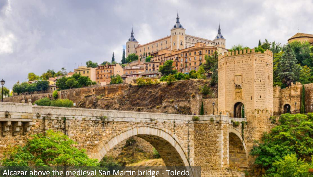
Alcazar above the medieval San Martin bridge - Toledo