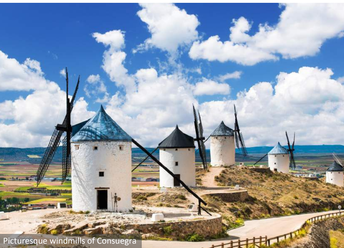
Picturesque windmills of Consuegra