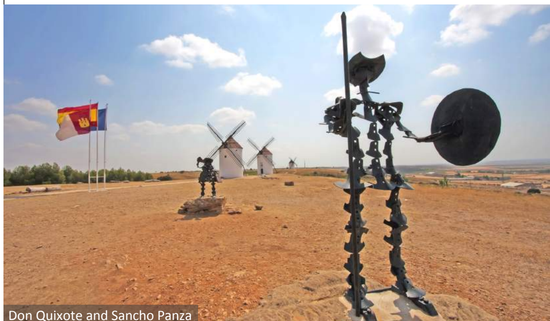
Don Quixote and Sancho Panza