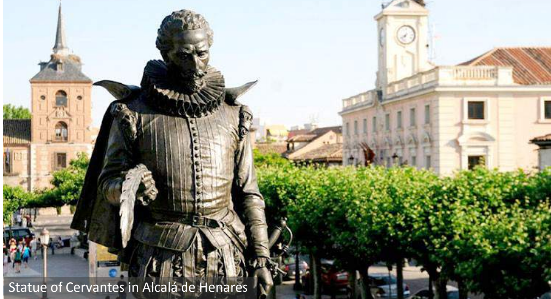
Statue of Cervantes in Alcalá de Henares

Not only our name, but also what we call our flagship tours, Scholarly Sojourns are intellectually-stimulating travel programs that explore fascinating topics in history, literature, archaeology, art history, and science. Designed and guided by distinguished scholars, these engaging journeys provide the unique opportunity to explore a subject on location.