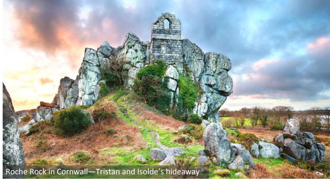
Roche Rock in Cornwall—Tristan and Isolde's hideaway

Not only our name, but what we call our flagship tours, Scholarly Sojourns are intellectually-stimulating vacations that explore subjects found in the traditional liberal arts curriculum. Designed and guided by distinguished professors, these engaging journeys provide the unique opportunity to explore a subject on location.