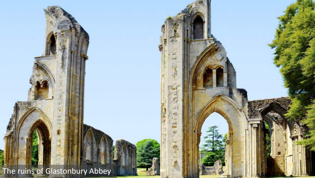
The ruins of Glastonbury Abbey