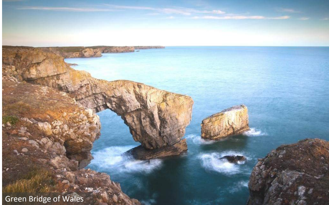
Green Bridge of Wales

Rain is likely at this time of year. Participants are encouraged to bring a lightweight, waterproof jacket or a small umbrella. The humidity levels vary greatly depending upon location. Inland is hotter and drier, while the coastal climate is slightly cooler and more humid.