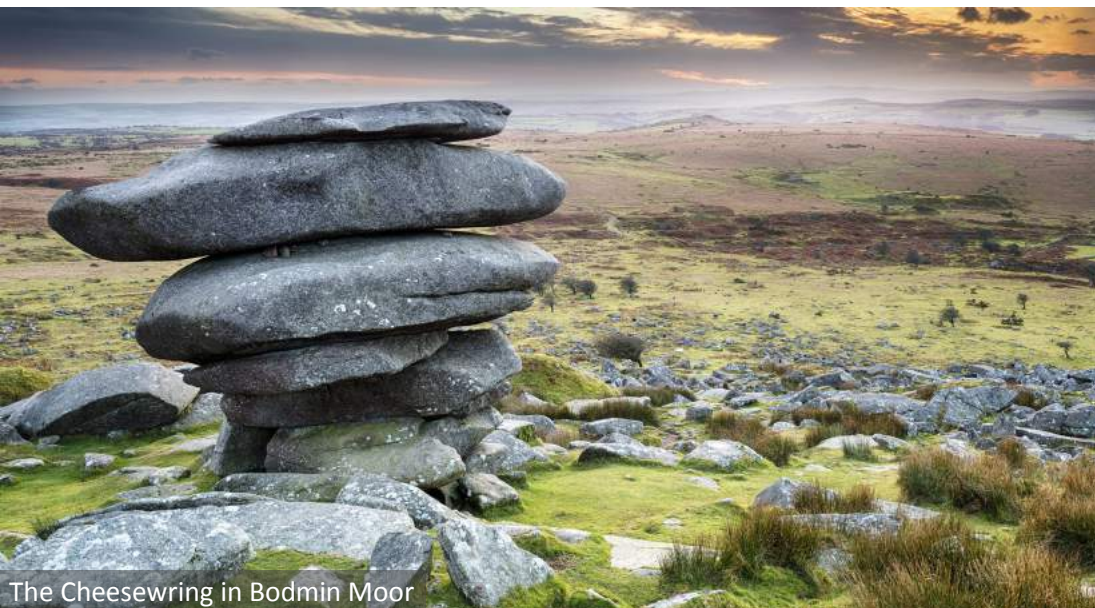
The Cheesewring in Bodmin Moor