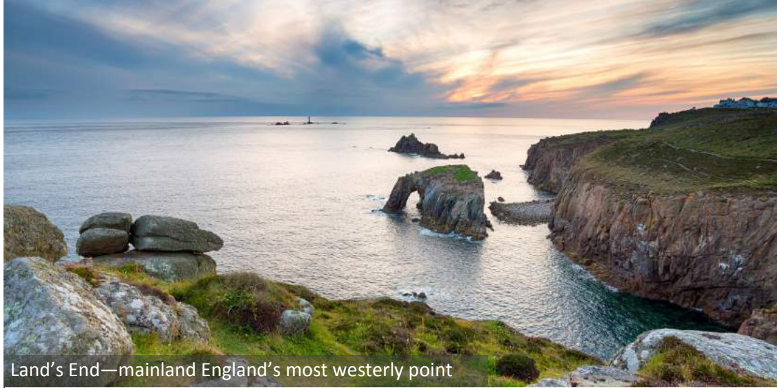
Land's End—mainland England's most westerly point