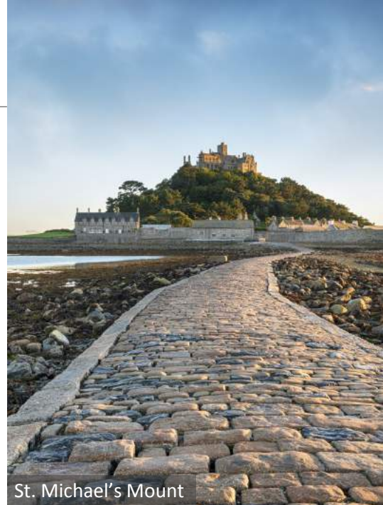
St. Michael's Mount

We travel east to Somerset this morning to visit the enormous, ancient hill fort known as Cadbury Castle. For centuries this prominent outcrop has been linked to King Arthur and widely regarded as one of the main contenders for the location of Camelot. Archaeological excavations have uncovered clear evidence of occupation during the Iron Age, and some locals believe that King Arthur still lies sleeping in a cave within the hill. We enjoy a Scholarly Sojourns signature picnic at the foot of this remarkable site before continuing to majestic Bath, a city so historically significant that it has been designated a UNESCO World Heritage Site. Here we consider how many historians, including Geoffrey of Monmouth, claim Bath to be the site of Arthur's last great battle, known as the Battle of Badon Hill, and then enjoy a generous period of free time to explore the city on our own. This afternoon we take a scenic drive through the breathtaking Cheddar Gorge—an amazing natural phenomenon that is Britain's largest gorge—which rewards us with stunning views. A short drive from here we find our resting place for the next two nights in Wells, England's smallest city and home to a celebrated 8th-century cathedral that is widely regarded as one of the most unusual and beautiful cathedrals in Britain. After checking into our historic hotel, the evening is free to explore the city's atmospheric, medieval streets and perhaps enjoy one (or more) of its traditional pubs. (B,L)