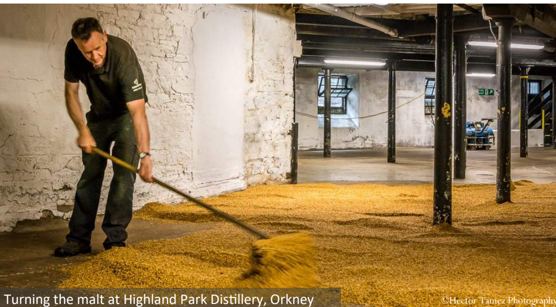
Turning the malt at Highland Park Distillery, Orkney