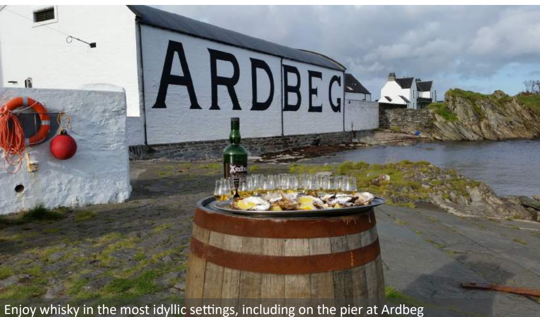
Enjoy whisky in the most idyllic settings, including on the pier at Ardbeg