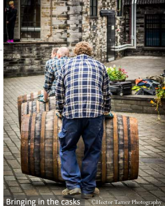
Bringing in the casks

We spend the day in Speyside today, enjoying in-depth visits at two of its most celebrated distilleries. The first stop is at iconic Speyside brand where we not only have the opportunity to visit its warehouse and sample some malts directly from the cask, but also get to taste some of it's rare historic bottlings and have the opportunity to fill our own bottle. After lunch, we travel to a progressive distillery where we have the opportunity to taste some of its unique peated malts and intriguing wood finishes. This afternoon we have the opportunity to sample some of the unique expressions from one of Scotland's premier whisky bottlers before returning to our stately hotel in Rothes where we enjoy a gourmet meal paired with Speyside Malts. [B | D]