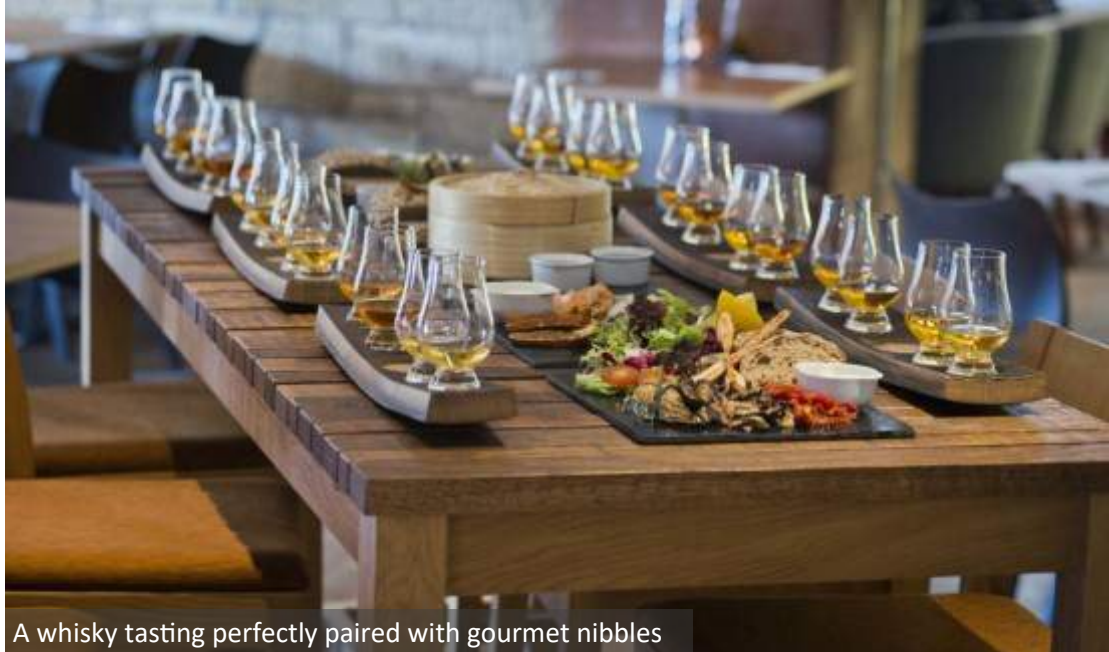
A whisky tasting perfectly paired with gourmet nibbles