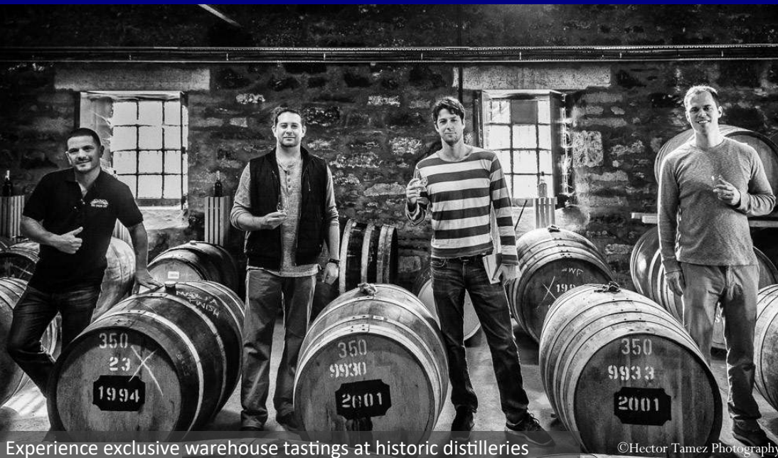
Experience exclusive warehouse tastings at historic distilleries