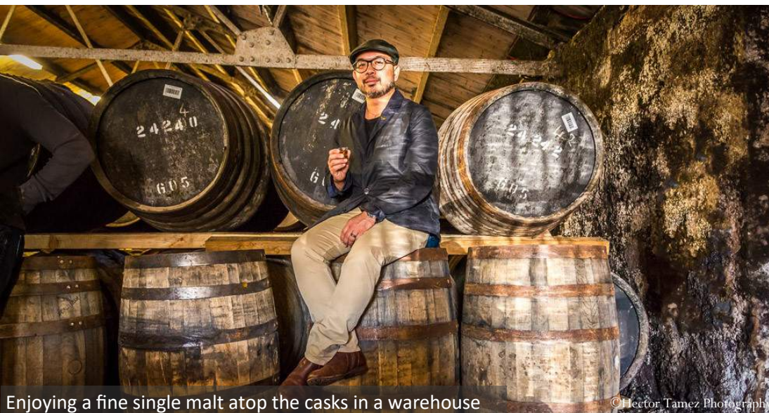
Enjoying a fine single malt atop the casks in a warehouse