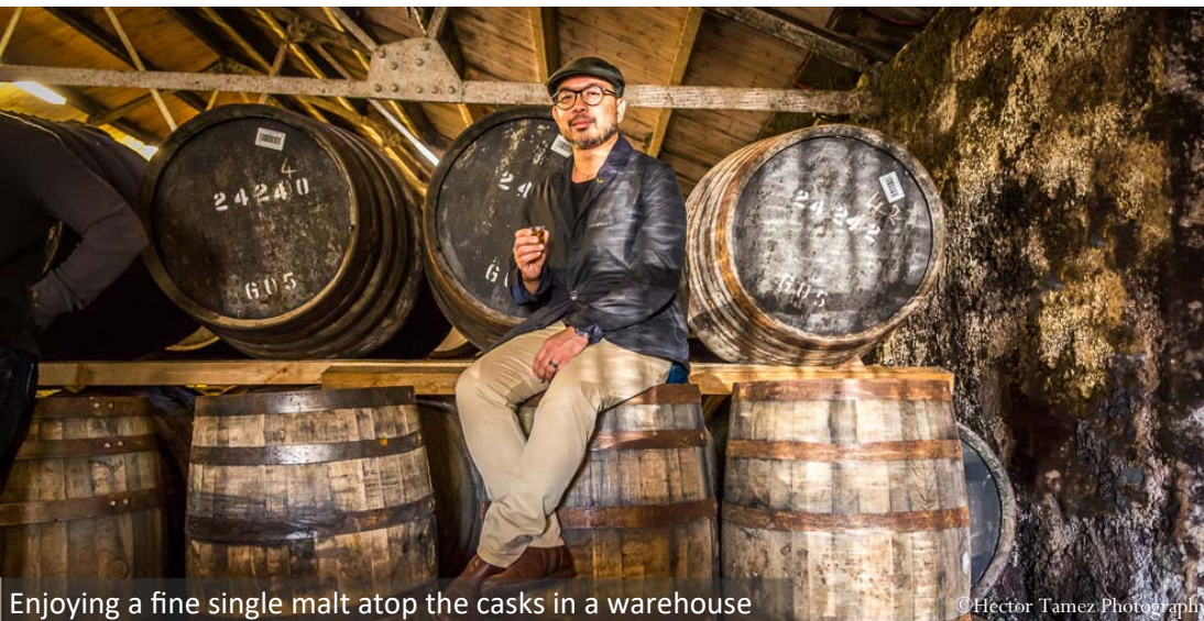
Enjoying a fine single malt atop the casks in a warehouse