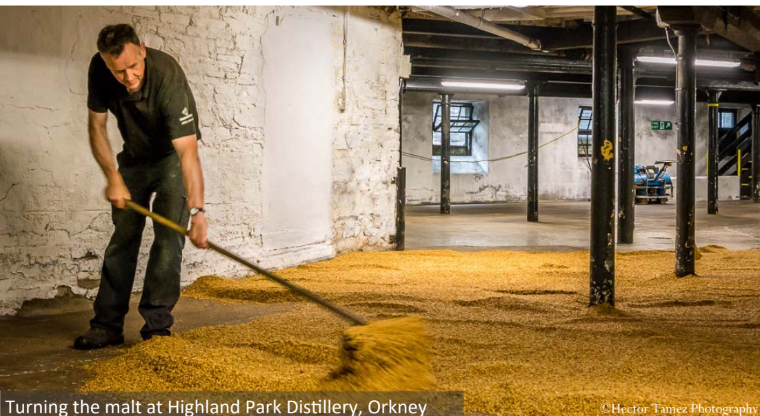
Turning the malt at Highland Park Distillery, Orkney