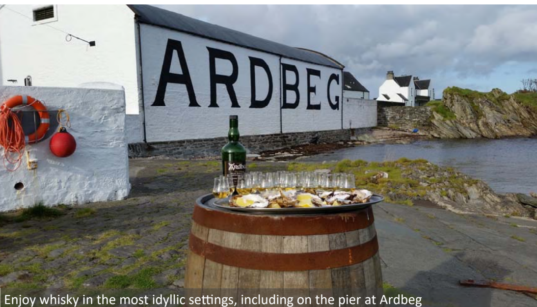
Enjoy whisky in the most idyllic settings, including on the pier at Ardbeg