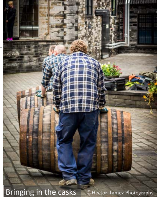
Bringing in the casks

An early ferry crossing this morning takes us over the North Sea to the legendary Orkney Islands—home to some of the most impressive prehistoric sites in Europe and also two of Scotland's most celebrated distilleries. Upon arrival, we visit Scapa Distillery to sample its unique island malt before we cross the island to explore the Standing Stones of Stenness, the Ring of Bridger, and the remarkable Neolithic settlement of Skara Brae. This afternoon, we travel to Kirkwall, the main settlement on Orkney, where we enjoy a true highlight of the tour—a visit to Highland Park Distillery with a tutored tasting of 7 drams from its award-winning range and the oppor-