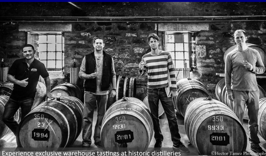
Experience exclusive warehouse tastings at historic distilleries