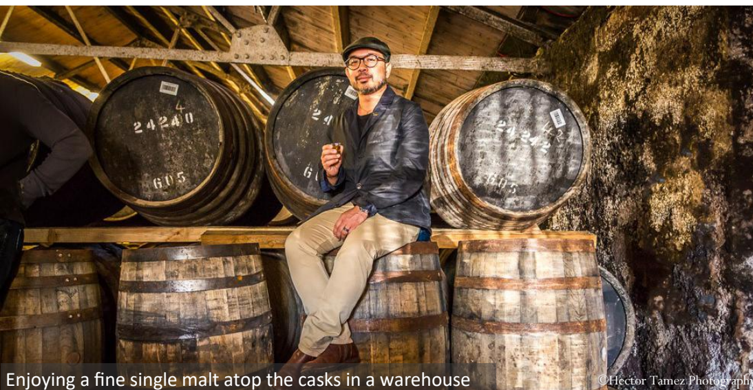
Enjoying a fine single malt atop the casks in a warehouse