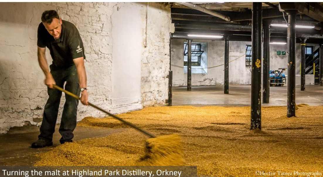
Turning the malt at Highland Park Distillery, Orkney