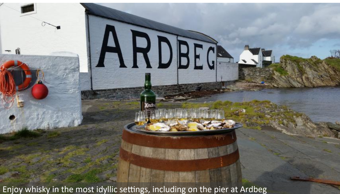
Enjoy whisky in the most idyllic settings, including on the pier at Ardbeg