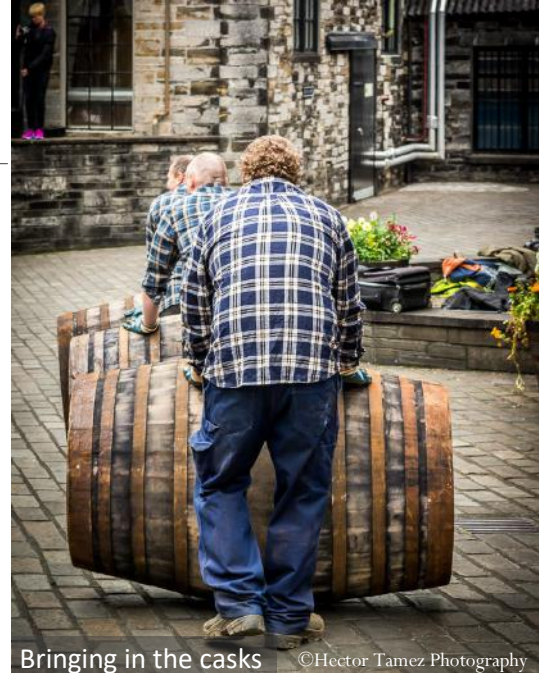
Bringing in the casks

An early ferry crossing this morning takes us over the North Sea to the legendary Orkney Islands—home to some of the most impressive prehistoric sites in Europe and also two of Scotland's most celebrated distilleries. Upon arrival, we visit Scapa Distillery to sample its unique island malt before we cross the island to explore the Standing Stones of Stenness, the Ring of Bridger, and the remarkable Neolithic settlement of Skara Brae. This afternoon, we travel to Kirkwall, the main settlement on Orkney, where we enjoy a true highlight of the tour—a visit to Highland Park Distillery with a tutored tasting of 7 drams from its award-winning range and the oppor-