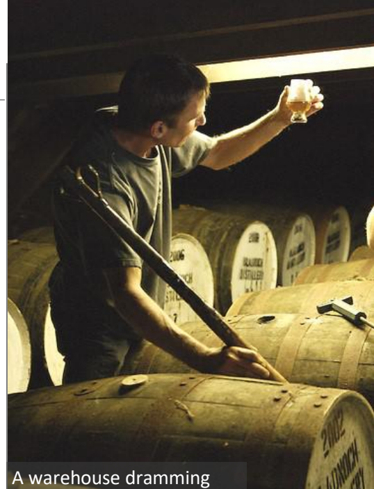
A warehouse dramming

We visit Campbeltown's two main distilleries—Glen Scotia and Springbank—today as well as go inside the warehouses of Scotland's oldest whisky bottler, Cadenhead's. Each of these experiences affords superb tasting opportunities as well as unique opportunities to hand fill bottles of rare single malt and also acquire exclusive, distillery-only bottlings. Before departing Campbeltown, we enjoy a very special lunch—the Campbeltown Platter—which features some of the excellent local seafood paired with whisky. Afterward, we take a short flight from Campbeltown to Glasgow where our tour draws to a close. [B | L]