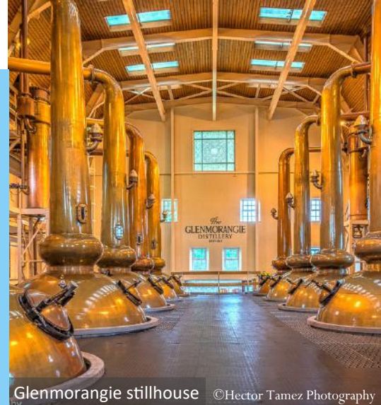
Glenmorangie stillhouse