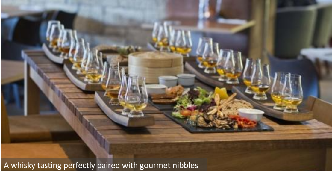
A whisky tasting perfectly paired with gourmet nibbles