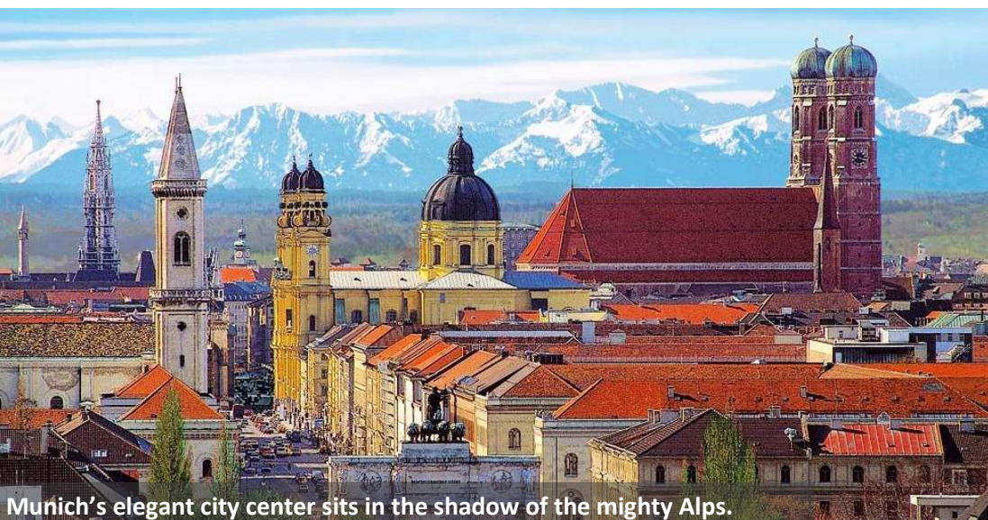
Munich's elegant city center sits in the shadow of the mighty Alps.