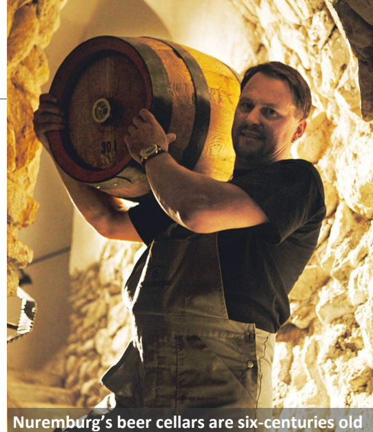
Nuremberg's beer cellars are six-centuries old

We depart Nuremberg this morning and venture off the beaten path into the Upper Palatinate (Oberpfalz) region of Bavaria, home to the legendary Zoigl beer—only available here in the remote north where it's brewed. We sample this unique, dark-ish, artisanal brew and enjoy lunch in one of the few remaining communal brewhouses where it is still crafted by families on a rotating basis. Afterward, we take a pleasant drive into the beautiful Upper Franconia region—the epicenter of brewing in Bavaria—stopping in the town of Bayreuth to visit the Maisel Brewery and Cooperage Museum which provides us with a glimpse of the significant role that casks and their coopers play in the maturation of beer. This evening we arrive in the