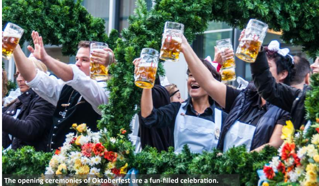
The opening ceremonies of Oktoberfest are a fun-filled celebration.