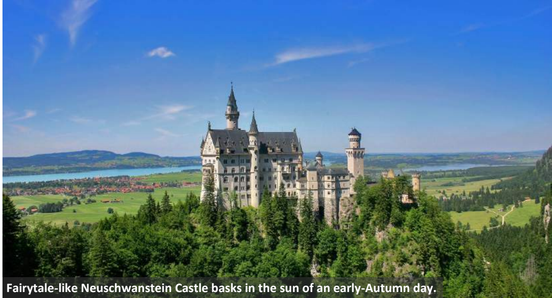
Fairytale-like Neuschwanstein Castle basks in the sun of an early-Autumn day.