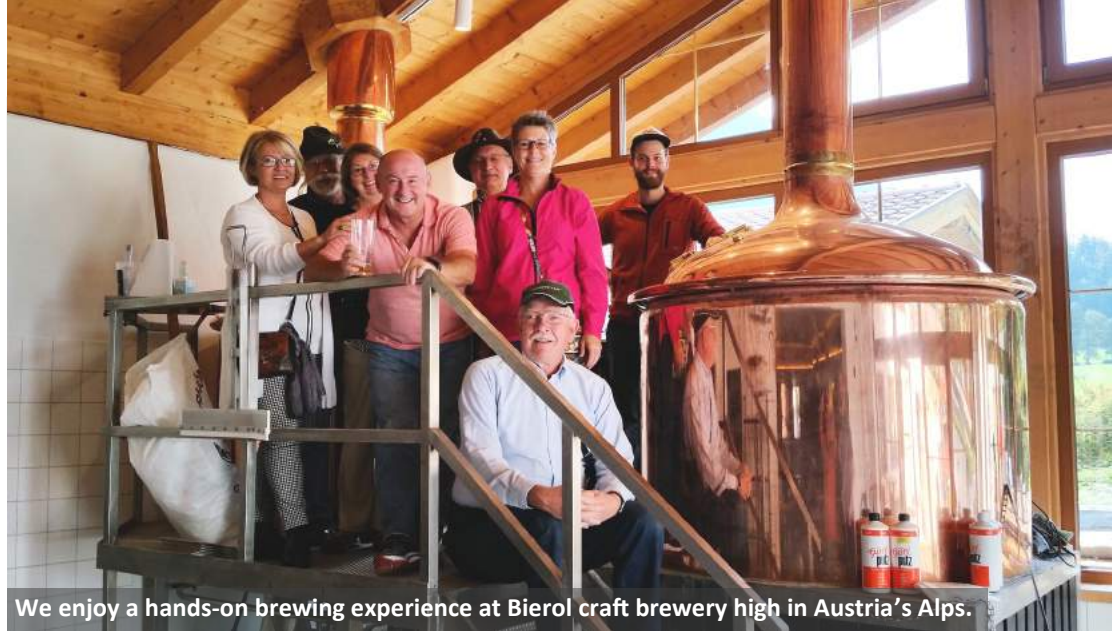
We enjoy a hands-on brewing experience at Bierol craft brewery high in Austria's Alps.