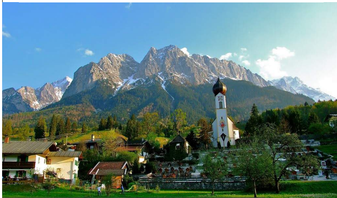
Experience stunning Alpine Scenery as we make our way through the Alps.

This morning you take a "final exam" in brewing and beer tasting, which tests your newly-acquired beer knowledge. Upon successfully passing, you are awarded a Certificate of Beer Knowledge signed by our tour leader himself. Afterward, we enjoy a unique Bavarian tradition—Frühschoppen (a brunch with beer)—and then you enjoy a bit more time to explore Bamberg's charming and historic center and perhaps do some last-minute souvenir shopping. At midday our tour comes to a close as we say our goodbyes. An optional shuttle will be offered for those wishing to go directly to Munich Airport. Those who are able may opt to stay an extra night in Munich in order to attend the festive closing ceremonies of Oktoberfest this evening. [B]