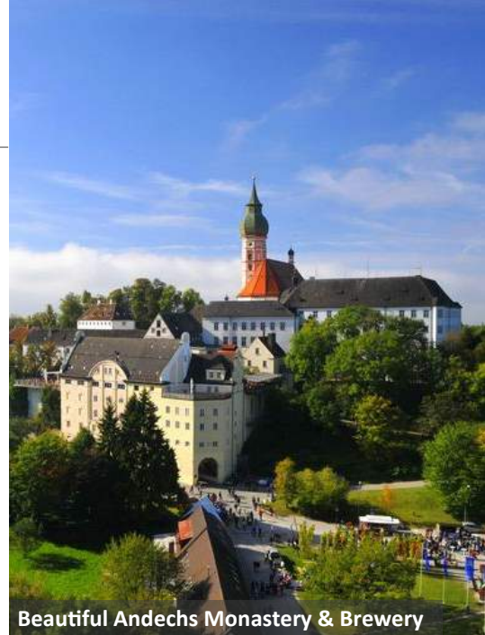
Beautiful Andechs Monastery & Brewery

After breakfast, we make our way to the Beer & Oktoberfest Museum which skillfully explains the history of beer from ancient times to the present day and examines the evolution of the brewing process. Afterward, we take part in a special seminar which provides an overview of different styles of beer made in Germany and introduces us to the sensory evaluation of them. At midday, we make our way back to the Oktoberfest grounds where we enjoy a special lunch in one of the festive tents. After the delicious meal of traditional German specialties, the remainder of the day is free for you to explore more of the city on your own (or perhaps remain at Oktoberfest). Tonight, a beer stroll is offered for those who wish to partake at some of Munich's most famous beer halls, Spatenhaus and Hofbräuhaus among them. [B | L]