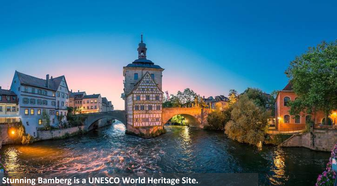
Stunning Bamberg is a UNESCO World Heritage Site.