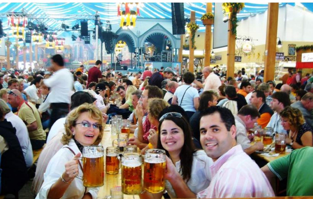
Enjoying a toast in a tent at Munich's Oktoberfest