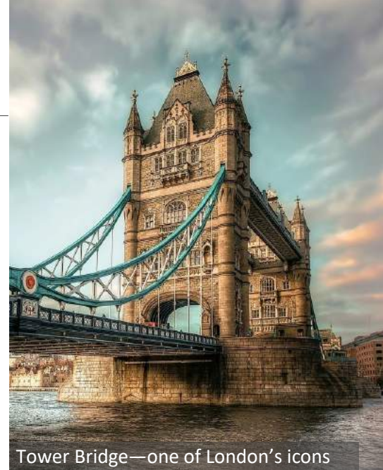
Tower Bridge—one of London's icons