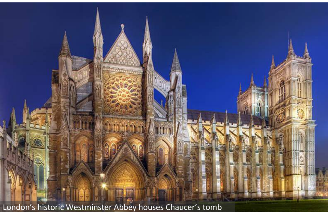
London's historic Westminster Abbey houses Chaucer's tomb

Following breakfast and our briefing this morning, we take on a unique challenge: we attempt to recreate the London of Chaucer's day. Although the bustling city around us is a 21st-century marvel, we seek to uncover its few remaining 14th-century artifacts. We explore its hidden nooks and crannies, traipse its back alleys, and visit its most historic structures. Our goal is to discover a side of this city that will provide us a fleeting glimpse of exactly what Chaucer's world was like. Our endeavor takes us to some of the most unique and atmospheric corners of this historic city as we attempt to immerse ourselves in the world of his pilgrims. The highlight of our day is a