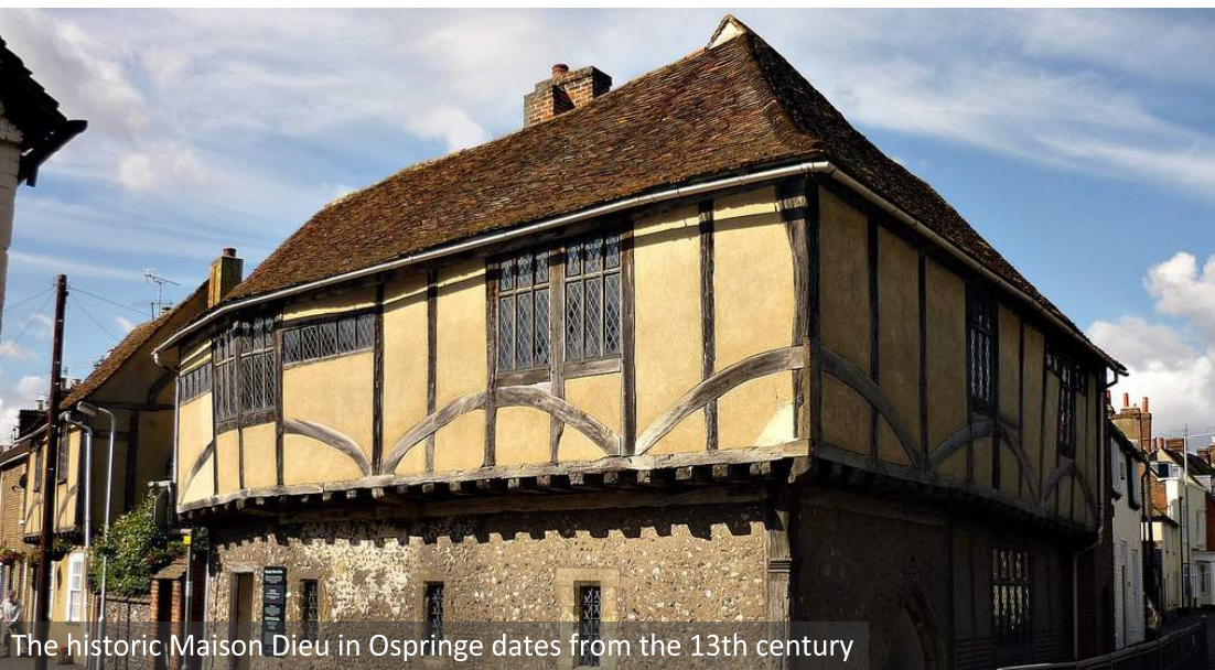
The historic Maison Dieu in Ospringe dates from the 13th century

For a complete list of lodging on this tour, please visit www.scholarlysojourns.com .