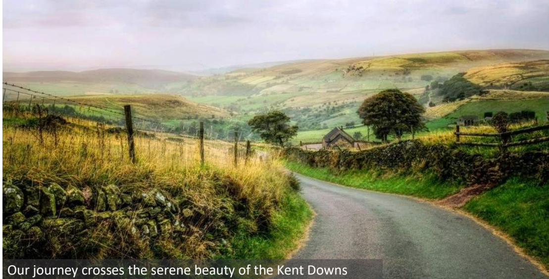
Our journey crosses the serene beauty of the Kent Downs