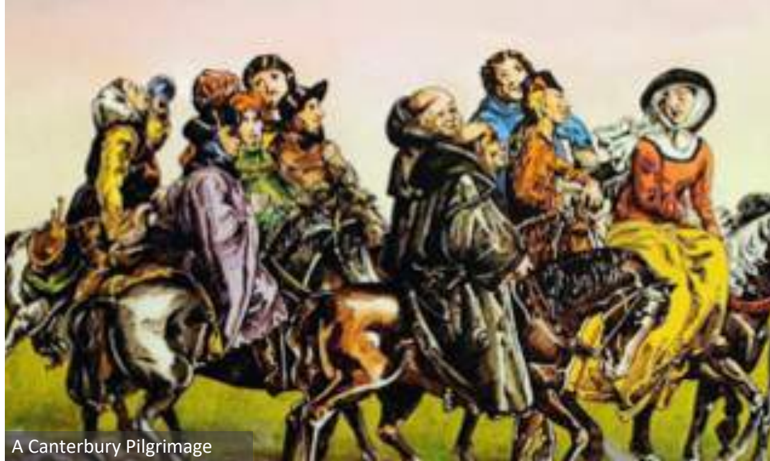
A Canterbury Pilgrimage

These exhilarating tours combine a love of learning with physical adventure. From hiking the English Lake District while exploring the Romantic Poets to sailing the Wine-Dark Sea while enjoying Homer's epics, Active Scholar Sojourns are designed to keep participants both mentally engaged and physically challenged.