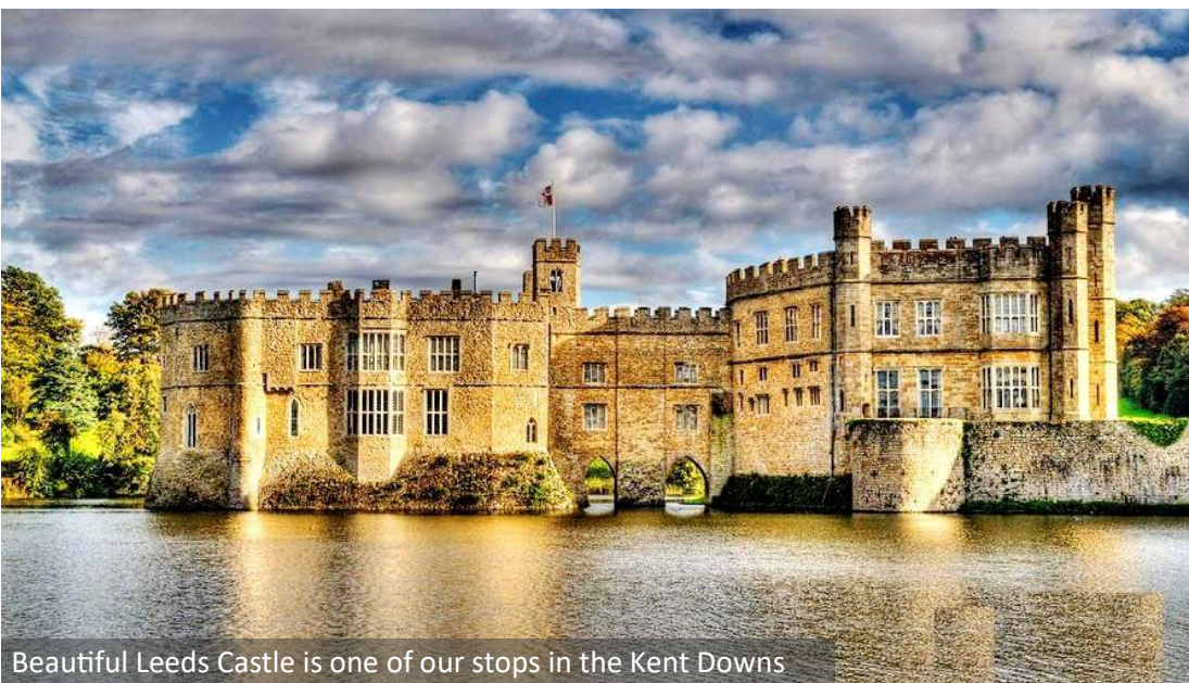
Beautiful Leeds Castle is one of our stops in the Kent Downs