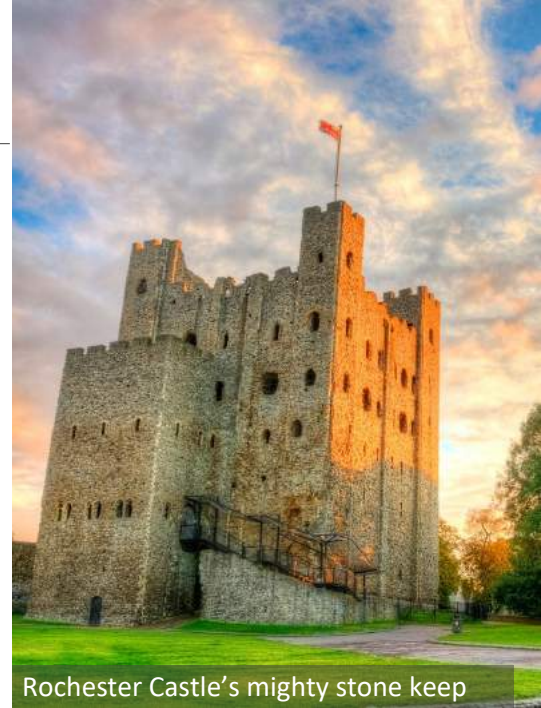
Rochester Castle's mighty stone keep

Following a good night's rest and a hearty breakfast, we enjoy a morning briefing with our tour leader and listen to The Knight's Tale before setting off across the downs. A short walk brings us to imposing Leeds Castle, a structure world-