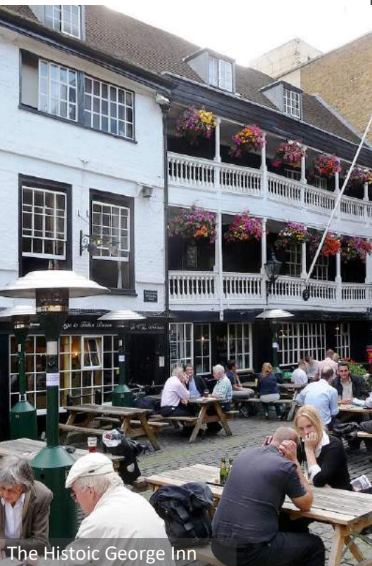
The Historic George Inn