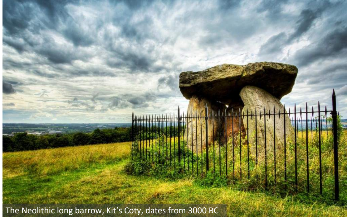
The Neolithic long barrow, Kit's Coty, dates from 3000 BC

CITY OF LONDON WESTMINSTER ABBEY CHAU CER'S TOMB THOMAS À WATERING STREAM GREENWICH PARK GREENWICH ROYAL OBSERVATORY LESNES ABBEY ROCHESTER CATHEDRAL ROCHESTER CASTLE THE KENT DOWNS KIT'S COTY HOUSE THE COUNTLESS STONES THE VILLAGE OF THURNHAM LEEDS CASTLE NORTH DOWNS THE VILLAGE OF WYE THE VILLAGE OF OSPRINGE THE MAISON DIEU HOSPITAL OF ST. NICOLAS THE TOWN OF FAVERSHAM CANTERBURY CATHEDRAL BEANY HOUSE OF ART AND KNOWLEDGE ST. AUGUSTINE'S ABBEY EASTBRIDGE HOSPITAL CANTERBURY HERITAGE MUSEUM