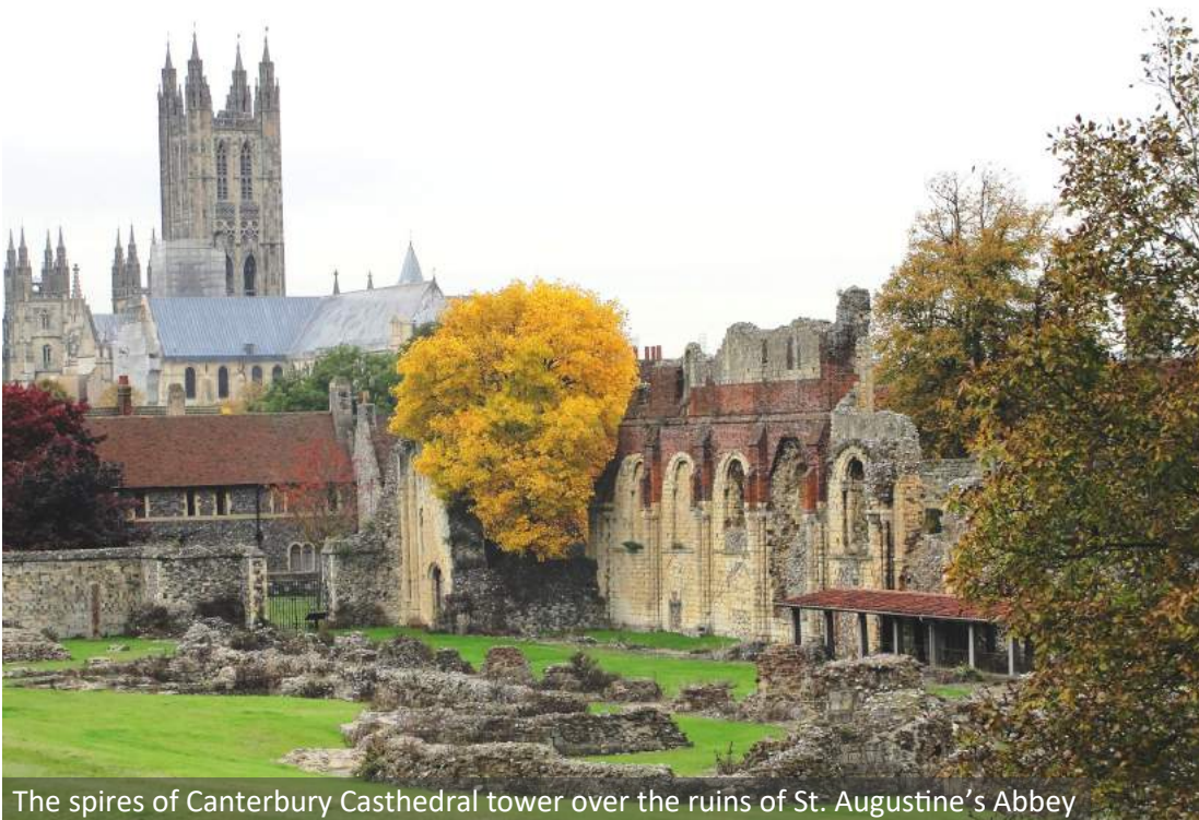
The spires of Canterbury Cathedral tower over the ruins of St. Augustine's Abbey