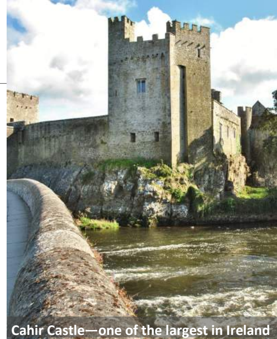
Cahir Castle—one of the largest in Ireland

Following breakfast we travel to the nearby Rock of Dunamase which sits atop a rocky outcrop and provides stunning views across the surrounding planes. Archaeological evidence suggests a hill fort was first built in this location as early as the 9th century. Following our visit, we continue south to explore one of Ireland’s most-photographed castles—the Rock of Cashel—which was the traditional seat of the Kings of Munster for centuries prior to the Norman Invasion. The ruins that remain today are comprised of several structures, including a fortress and a cathedral. Continuing southward after lunch, we arrive at Cahir Castle—another photogenic edifice which has been used as a setting in numerous films and television serials, including Excalibur and The Tudors . One of the largest castles in Ireland, its name originates from the stone fort (or cathair ) which was originally located on this site. Following our visit, we travel a short distance to our lodging in vibrant Cork, Ireland’s second largest city, where the evening is left free to explore and dine on your own. [B]