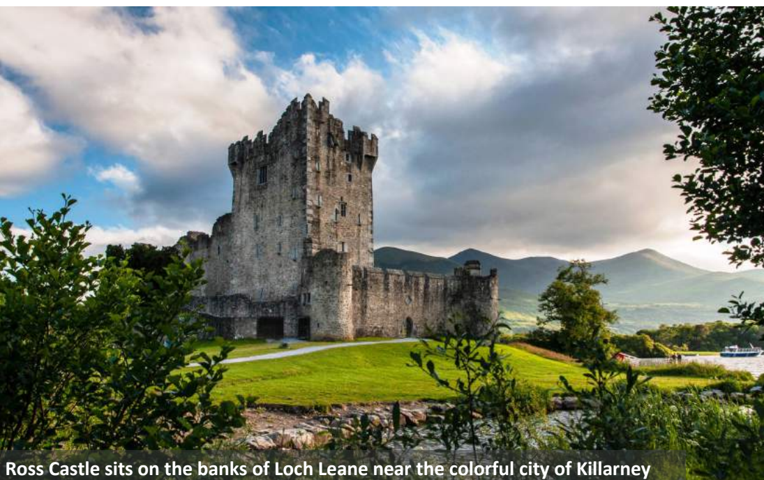
Ross Castle sits on the banks of Loch Leane near the colorful city of Killarney