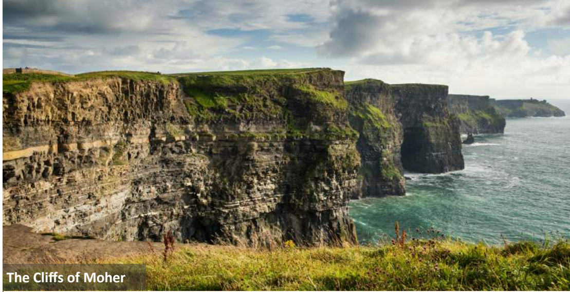
The Cliffs of Moher