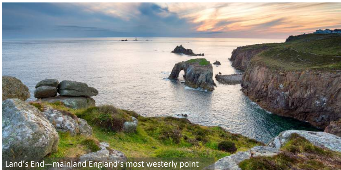
Land's End—mainland England's most westerly point