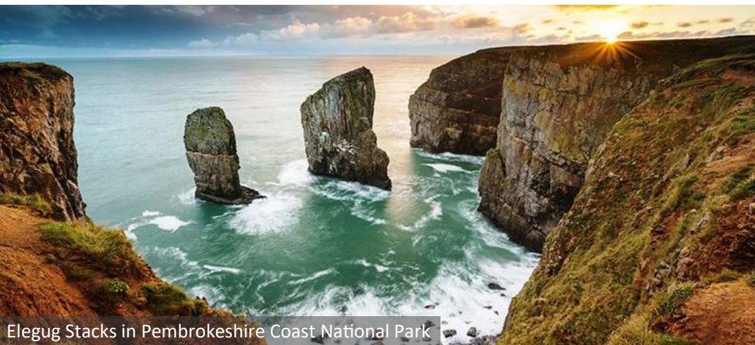
Elegug Stacks in Pembrokeshire Coast National Park