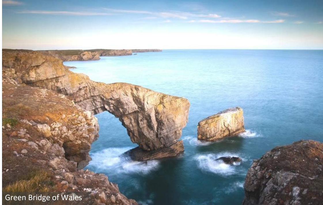
Green Bridge of Wales

Rain is likely at this time of year. Participants are encouraged to bring a lightweight, waterproof jacket or a small umbrella. The humidity levels vary greatly depending upon location. Inland is hotter and drier, while the coastal climate is slightly cooler and more humid.