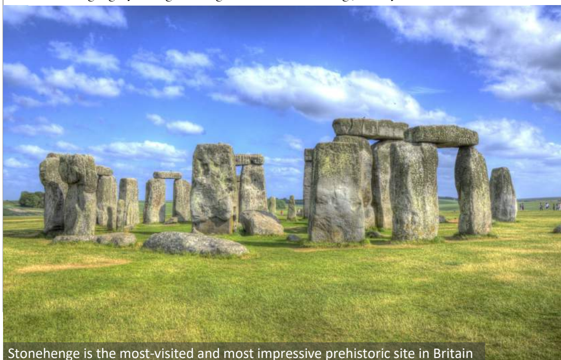
Stonehenge is the most-visited and most impressive prehistoric site in Britain

Following breakfast we travel to nearby Glastonbury to enjoy a guided walking tour which leads us to sites such as Chalice Well, the purported resting place of the Holy Grail. Those who wish can climb Glastonbury Tor—an ancient hill set in the middle of the remarkable Summerland Meadows plain which offers panoramic views of the surrounding countryside. We conclude with a visit to Glastonbury Abbey, home to the purported tomb of King Arthur and Queen Guinevere, which was discovered in 1191. It is fitting, perhaps, that our tour draws to a close here as we say our good-byes, not only to each other, but also to the “Once and Future King” whose rich and fascinating legacy brought us together for this amazing journey. [B]