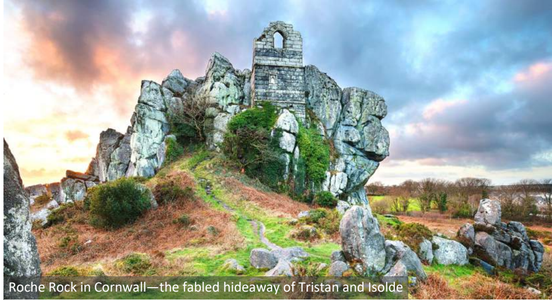
Roche Rock in Cornwall—the fabled hideaway of Tristan and Isolde

Not only our name, but also what we call our flagship tours, Scholarly Sojourns are intellectually-stimulating travel programs that explore fascinating topics in history, literature, archaeology, art history, and science. Designed and guided by distinguished scholars, these engaging journeys provide the unique opportunity to explore a subject on location.