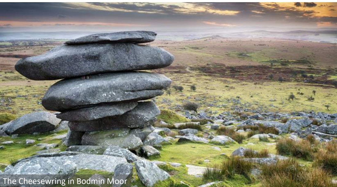
The Cheesewring in Bodmin Moor

For a complete list of lodging on this tour, please visit www.scholarlysojourns.com .