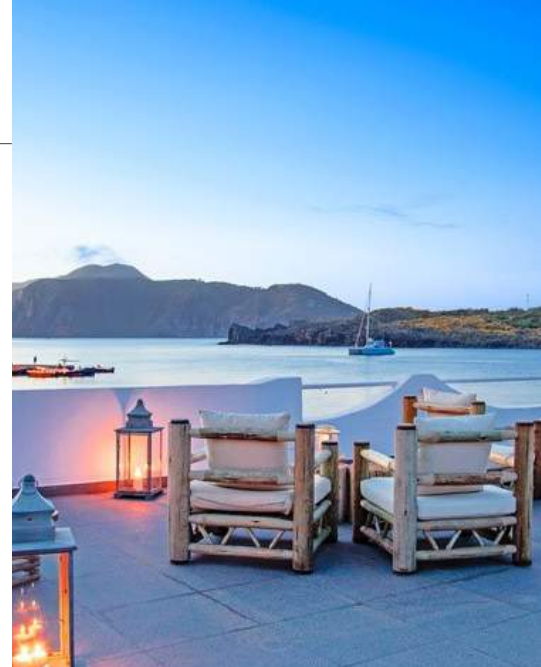
Mari del Sud Resort's typical Aeolian Style

Each of the regions that we visit is truly distinct—each has its own traditions, an individual atmosphere, and, of course, a unique and delicious cuisine. We investigate their culinary styles with hands-on cooking classes in Naples, Sorrento, Syracuse, and Lecce. In addition, we enjoy a demonstration on traditional Sicilian pastries and have ample opportunities to sample local street foods throughout the sojourn.