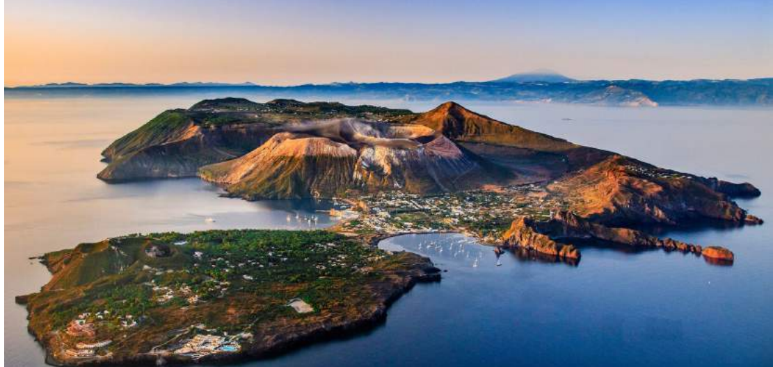
The unique beauty of the Aeolian Islands—a UNESCO World Heritage Site

bubbling mud pits, and active volcanos is one of Europe's most interesting geological areas. After checking into our hotel, we depart on a special boat tour which takes us to the nearby large island of Lipari; the chic, exclusive island of Panarea; and finally, the conical-shaped island of Stromboli which is famous for its active volcano that continually spews ash and lava from its crater. The volcano's state of endless eruption—named Strombolic Activity by volcanologists—has also given its name to a famous type of stuffed pizza eponymous with the island. As the sun sets, we sail around the backside of the island to watch in awe the bright bursts of red lava set against the night's sky and shimmering sea. Returning to Vulcano after dark, we enjoy a final toast together before saying goodnight. [B]