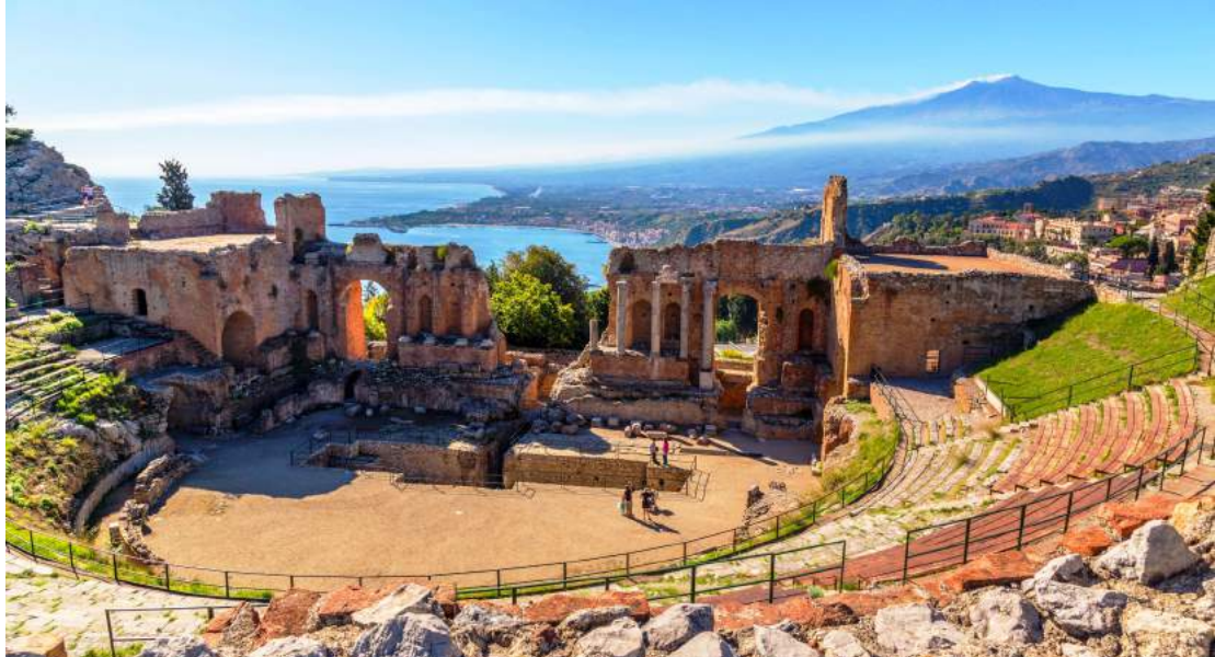
The ruins of Taormina's Greek Theatre with Mt. Etna in the background

These unique journeys give you the opportunity to engage with a variety of experts and explore a number of topics as you travel across areas of unparalleled beauty. Accompanied by your Scholarly Sojourns Sojourn Director, you journey in a small group to discover and sample the riches of the region.