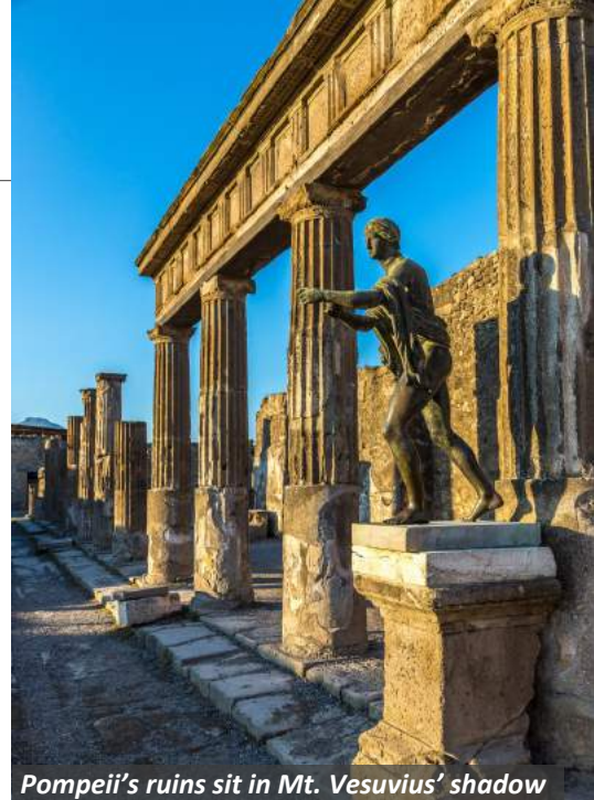
Pompeii's ruins sit in Mt. Vesuvius' shadow

Option: Those who wish can take an optional hike to the crater of Mt. Vesuvius and then spend less time at Pompeii.