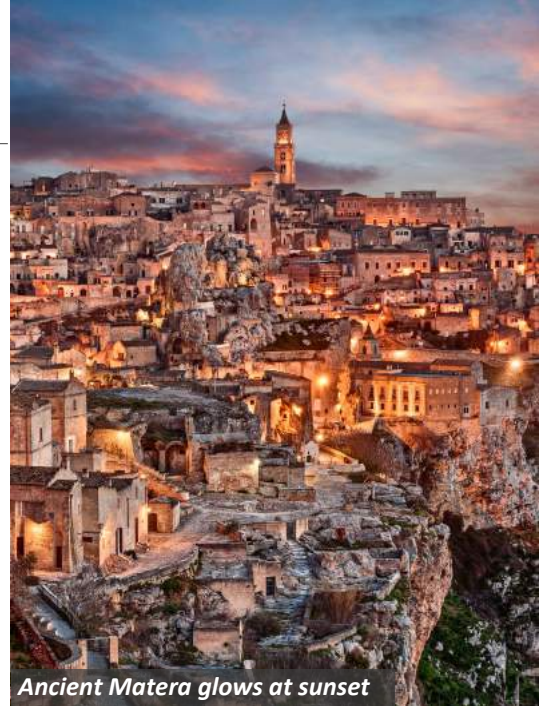
Ancient Matera glows at sunset

Many of the Western World's most important archaeological sites are found in Southern Italy and we explore several of them during our sojourn. Together we walk the streets of ruined city of Pompeii and we go inside the spectacular temples found at Agrigento—considered one of the most outstanding examples of Greater Greece art and architecture. And, for a truly unique experience, we stay in a cave hotel in ancient Matera—the city of caves where humans have dwelt for over 9,000 years.