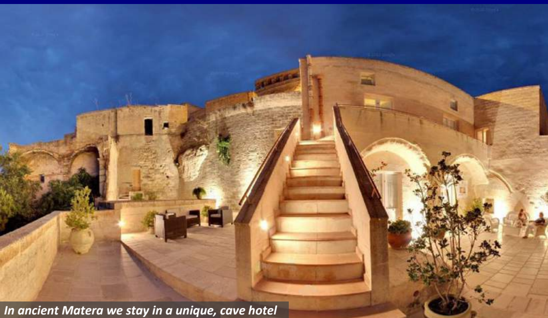
In ancient Matera we stay in a unique, cave hotel

"This was an amazing, once-in-a-lifetime experience that I will take with me personally and professionally for the rest of my life."