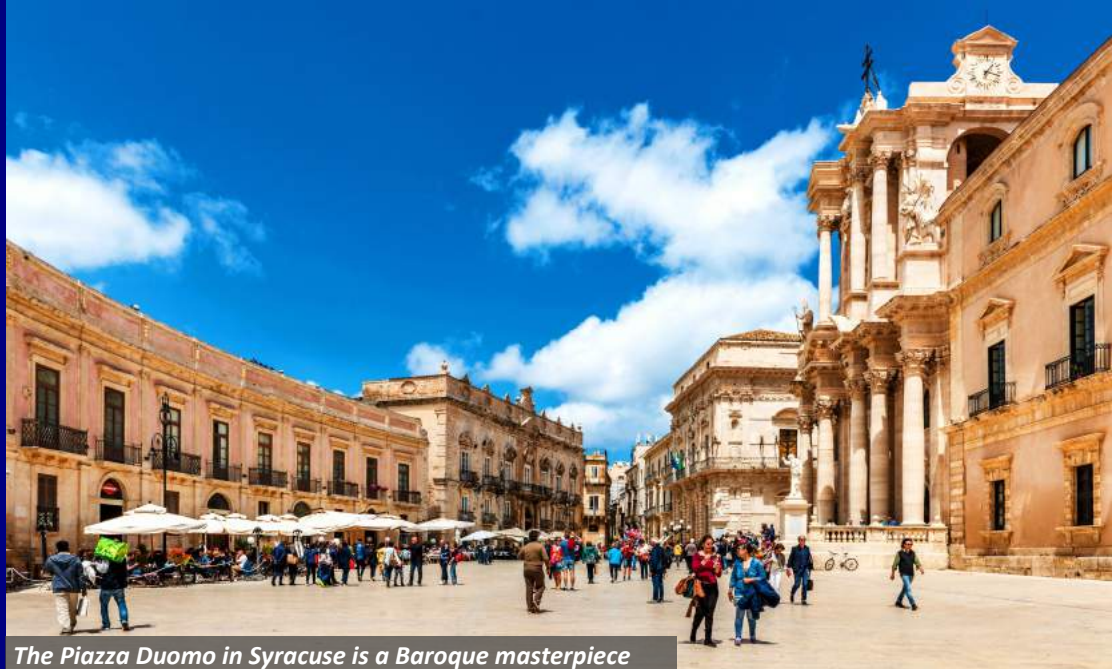
The Piazza Duomo in Syracuse is a Baroque masterpiece