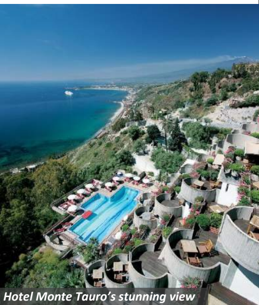
Hotel Monte Tauro's stunning view

Just a five-minute walk from the ancient Greco-Roman theatre and the main piazzas of the town, Hotel Monte Tauro in Taormina provides a tranquil oasis with panoramic views of Naxos Bay. Each of its spacious and elegantly-furnished rooms includes a balcony or terrace with views over the Ionian Sea. The hotel also offers an enormous pool with hydro-massage jets, a sea-view restaurant, and a delightful, rooftop cocktail bar. Taormina’s main shopping and dining area is just 500 feet away and a short cable-car ride from there connects the town with the sands of Isola Bella Beach below.