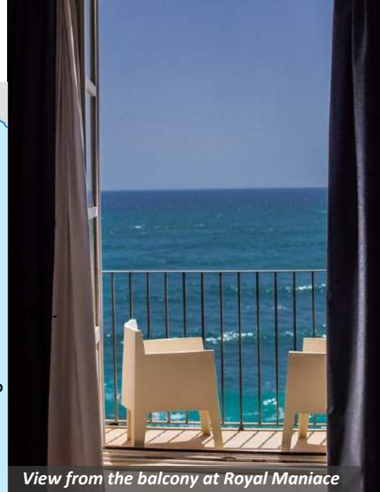
View from the balcony at Royal Maniace