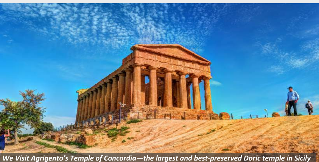
We Visit Agrigento's Temple of Concordia—the largest and best-preserved Doric temple in Sicily