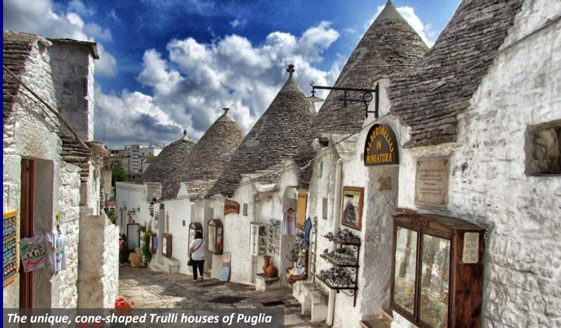
The unique, cone-shaped Trulli houses of Puglia