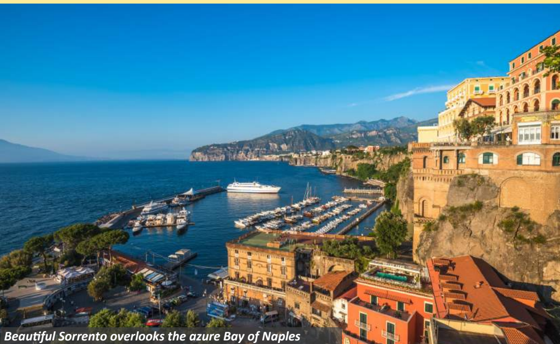
Beautiful Sorrento overlooks the azure Bay of Naples