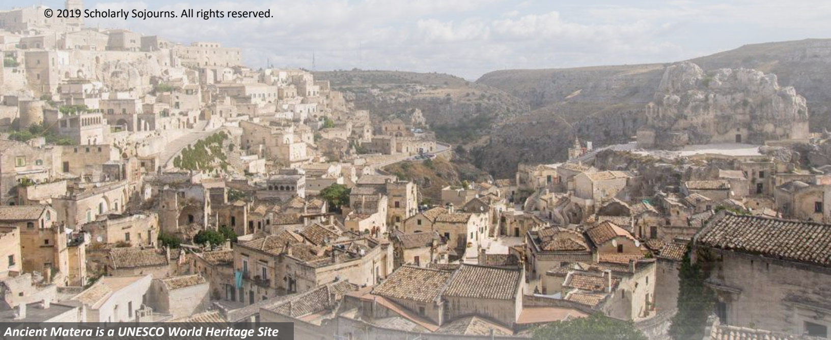
Ancient Matera is a UNESCO World Heritage Site

Scholarly Sojourns is happy to assist you with booking additional nights prior to the start of your tour or following its conclusion. Often we are able to secure better rates than are available to the general public. We are also happy to provide itinerary suggestions should you wish to do additional travel in Italy.