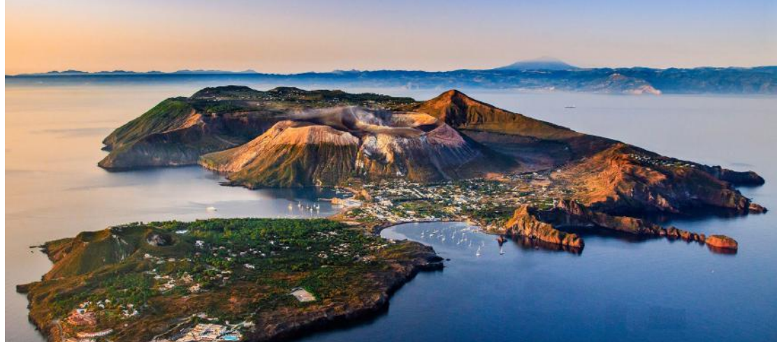
The unique beauty of the Aeolian Islands—a UNESCO World Heritage Site

bubbling mud pits, and active volcanos is one of Europe's most interesting geological areas. After checking into our hotel, we depart for a special cruise which takes us on a panoramic journey through the islands, including stops on chic, exclusive Panarea and the cone-shaped island of Stromboli, which is famous for its active volcano that continually spews ash and lava from its crater. The volcano's state of continuous eruption—named Strombolic Activity by volcanologists—has also given its name to a famous type of stuffed pizza eponymous with the island. Our cruise culminates with a spectacular show as we anchor just offshore, affording us some time to gaze in awe at bright bursts of red lava set against the evening sky and shimmering sea. Returning to Vulcano after dark, we enjoy a final toast together before saying goodnight. [B]