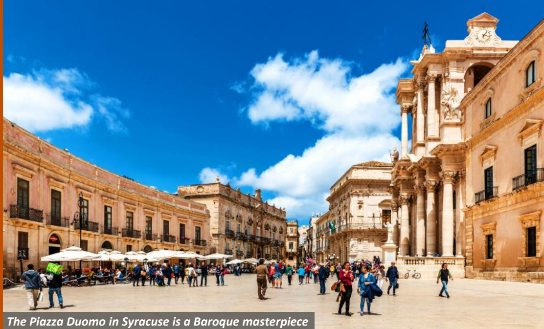
The Piazza Duomo in Syracuse is a Baroque masterpiece