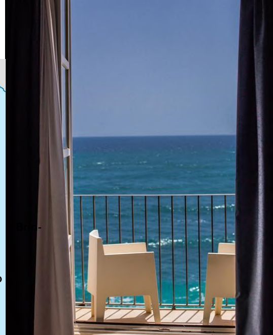
View from the balcony at Royal Maniace