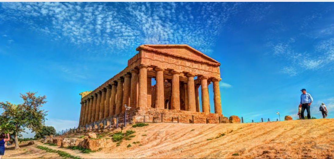
We Visit Agrigento's Temple of Concordia—the largest and best-preserved Doric temple in Sicily

Many of the Western World's most important archaeological sites are found in Southern Italy and we explore several of them during our sojourn. Together we walk the streets of ruined city of Pompeii and we go inside the spectacular temples found at Agrigento—considered one of the most outstanding examples of Greater Greece art and architecture. And, for a truly unique experience, we stay in a cave hotel in ancient Matera—the city of caves where humans have dwelt for over 9,000 years.