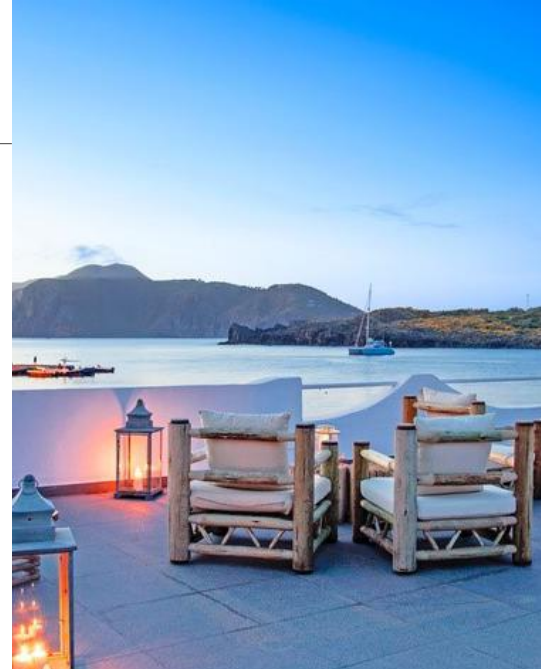
Mari del Sud Resort's typical Aeolian Style

Each of the regions that we visit is truly distinct—each has its own traditions, an individual atmosphere, and, of course, a unique and delicious cuisine. We investigate their culinary styles with hands-on cooking classes in Naples, Sorrento, Syracuse, and Lecce. In addition, we enjoy a demonstration on traditional Sicilian pastries and have ample opportunities to sample local street foods throughout the sojourn.