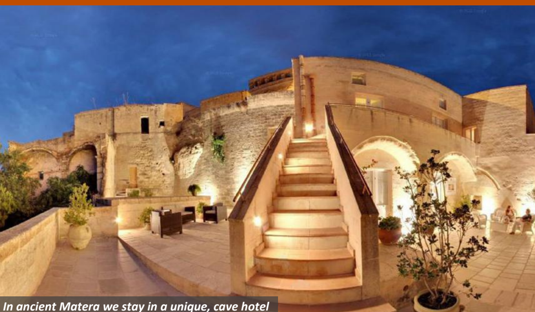
In ancient Matera we stay in a unique, cave hotel

"This was an amazing, once-in-a-lifetime experience that I will take with me personally and professionally for the rest of my life."