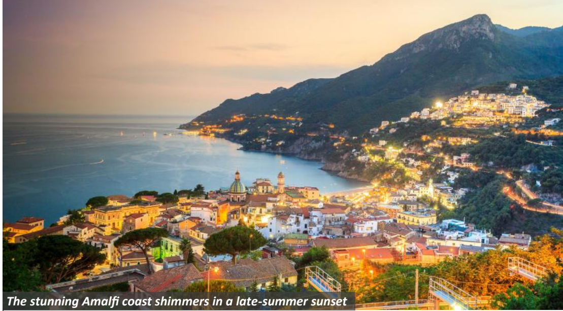
The stunning Amalfi coast shimmers in a late-summer sunset