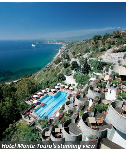
Hotel Monte Tauro's stunning view

Just a five-minute walk from the ancient Greco-Roman theatre and the main piazzas of the town, Hotel Monte Tauro in Taormina provides a tranquil oasis with panoramic views of Naxos Bay. Each of its spacious and elegantly-furnished rooms includes a balcony or terrace with views over the Ionian Sea. The hotel also offers an enormous pool with hydro-massage jets, a sea-view restaurant, and a delightful, rooftop cocktail bar. Taormina's main shopping and dining area is just 500 feet away and a short cable-car ride from there connects the town with the sands of Isola Bella Beach below.