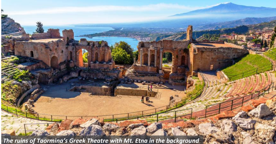
The ruins of Taormina's Greek Theatre with Mt. Etna in the background