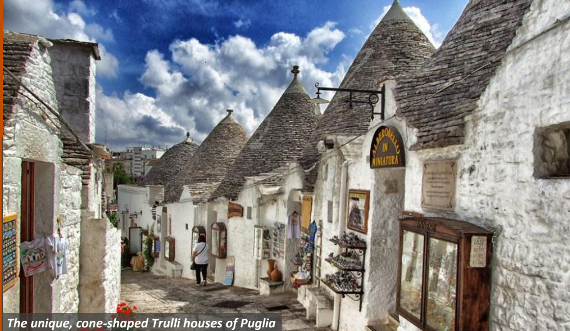
The unique, cone-shaped Trulli houses of Puglia