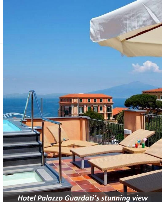
Hotel Palazzo Guardati's stunning view