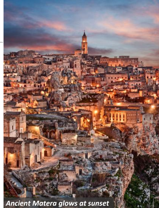
Ancient Matera glows at sunset