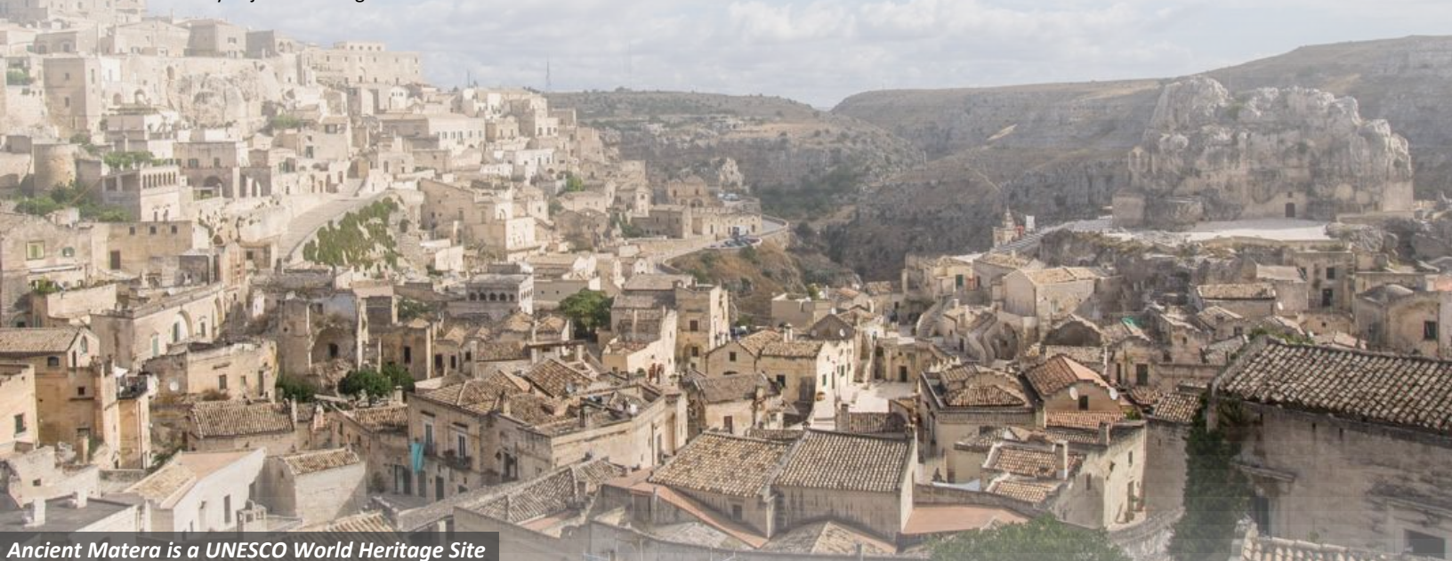
Ancient Matera is a UNESCO World Heritage Site

© 2019 Scholarly Sojourns. All rights reserved.